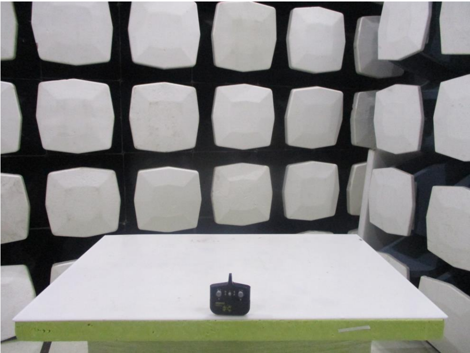
Up to 1GHz (EUT was placed in the centre of the turntable)