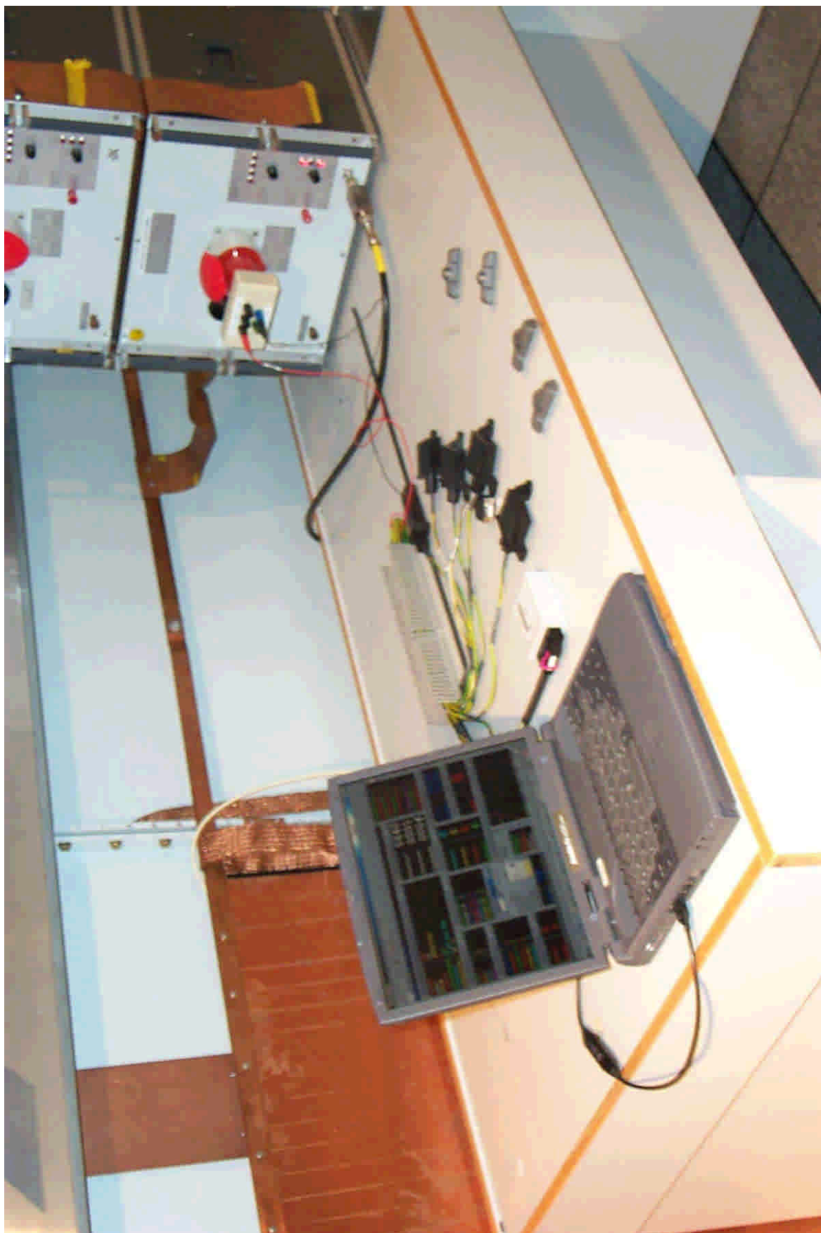
40458emi18.jpg: Test set-up conducted emission measurement