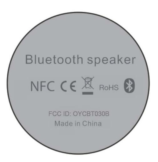
Proposed FCC ID Label Location