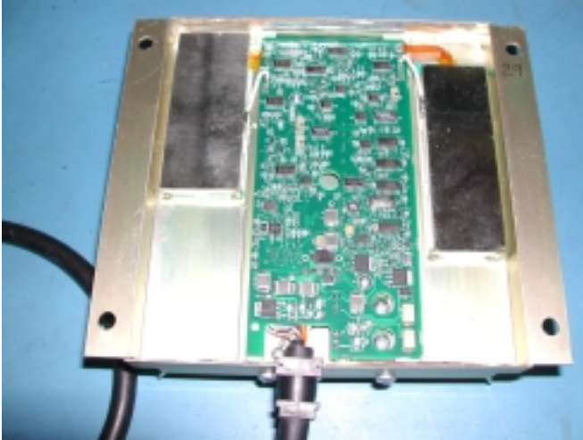
Photo of PV2000 receiver PCA mounted in antenna housing.

Photo of rear of PV2000 showing signal processing PCA (center) surrounded by shielded transmitter PCA (right side) and receiver PCA (left side).