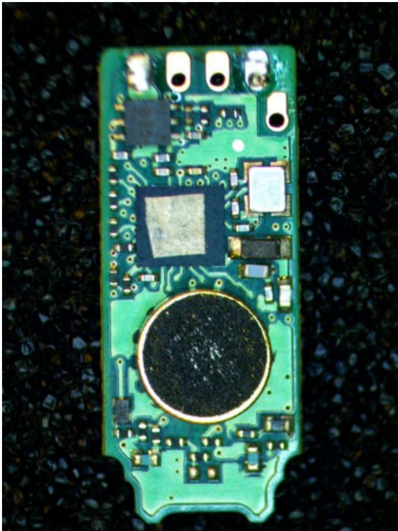
PCB photo top side A1006017RBT Rev 4.01