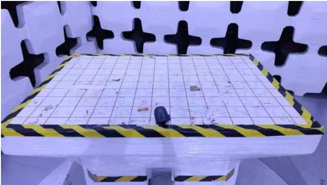
Up to 1GHz The EUT is placed at the center of turntable