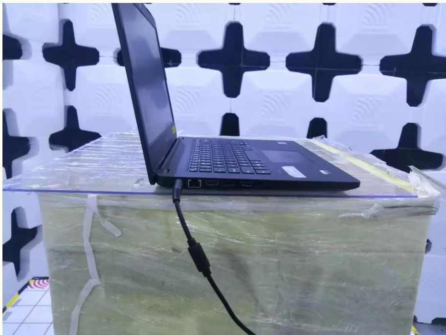
The EUT was placed at the center of turntable