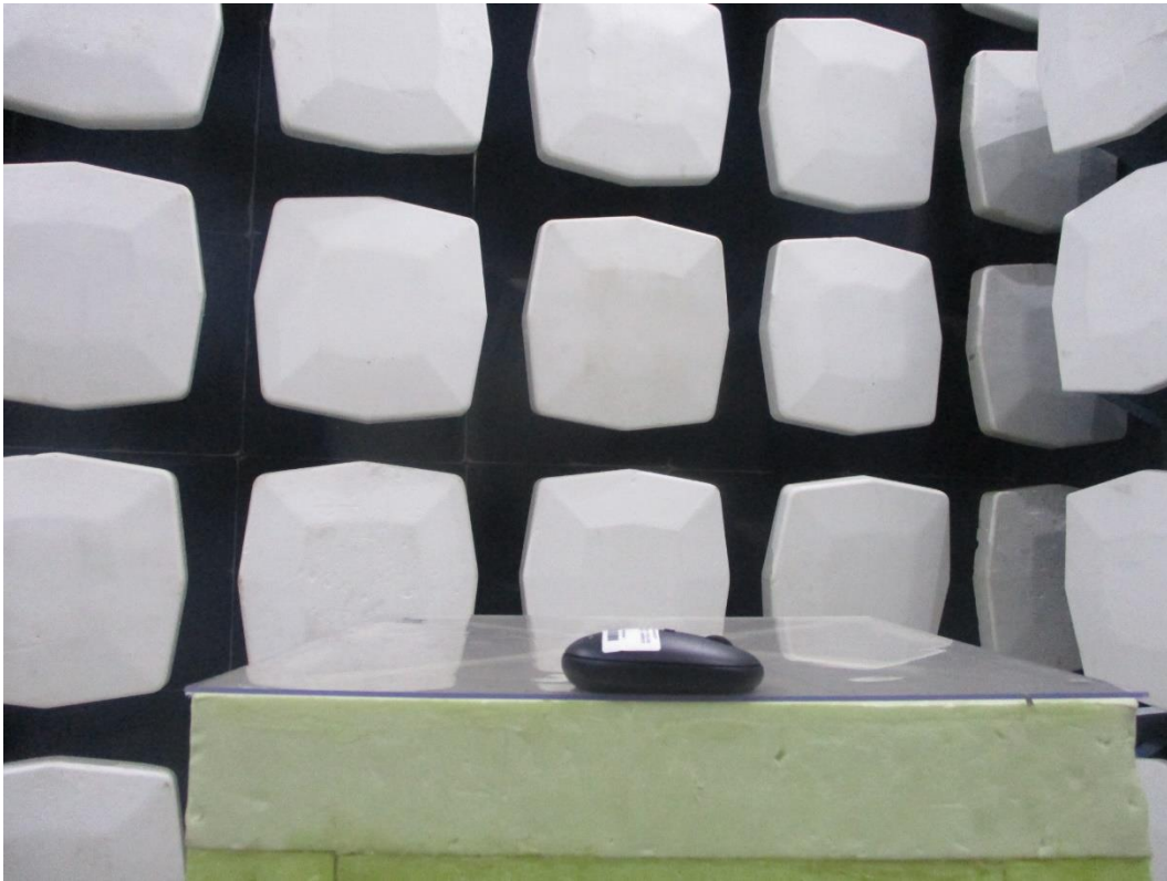
Above 1GHz The EUT is placed at the center of turntable