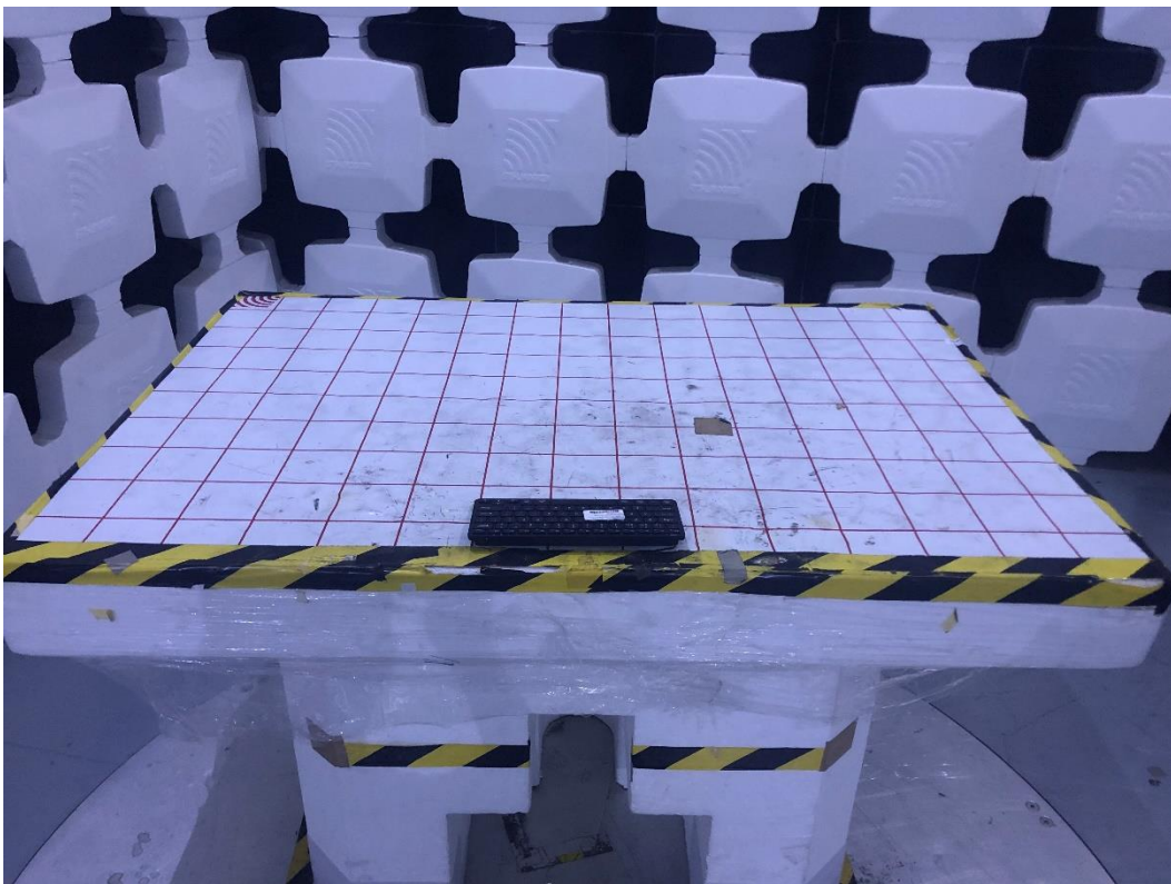
Below 1GHz The EUT is placed at the center of turntable