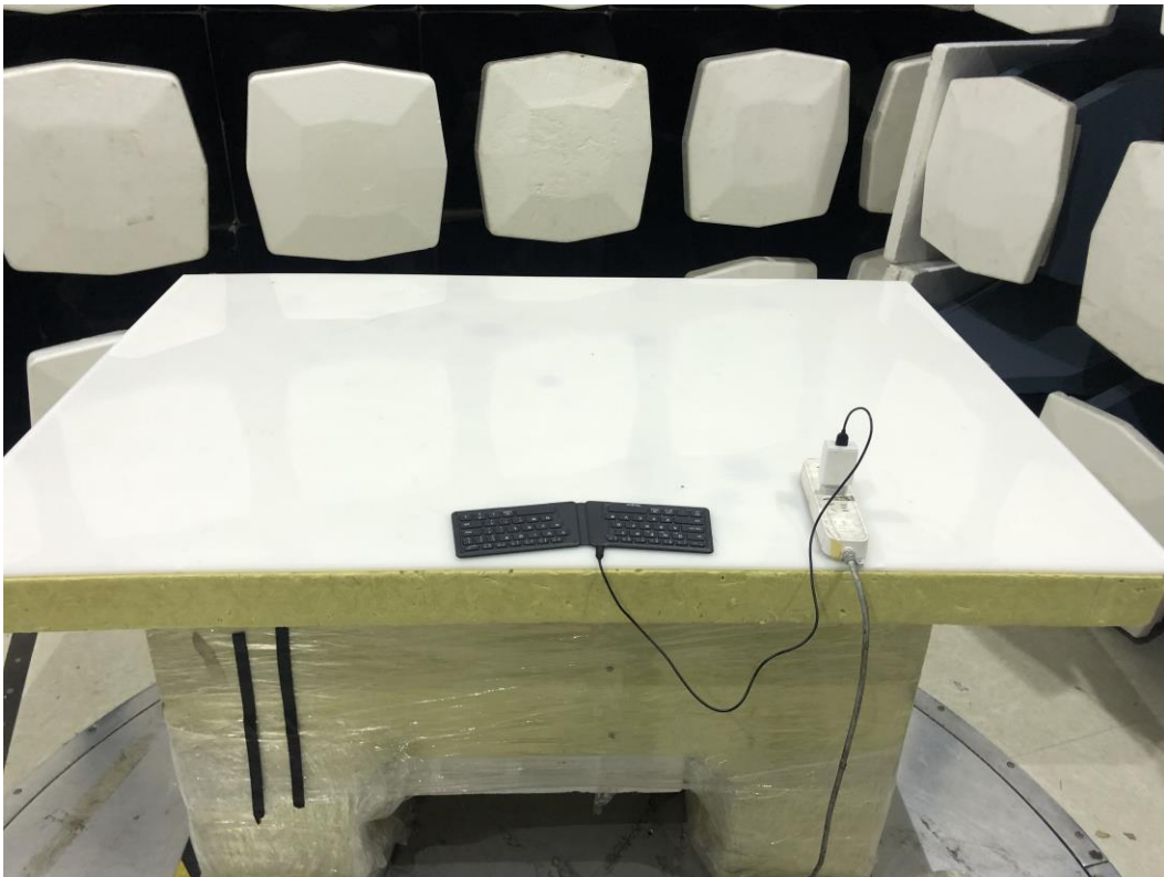
Below 1GHz The EUT is placed at the center of turntable