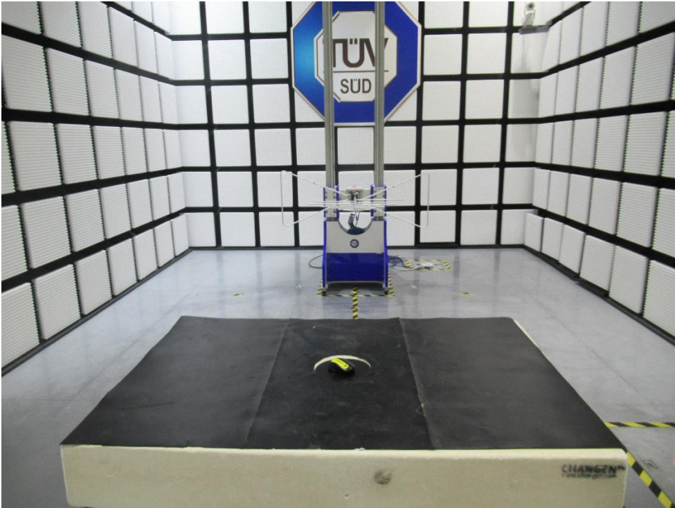
Radiated Emission Test 1GHz-18GHz