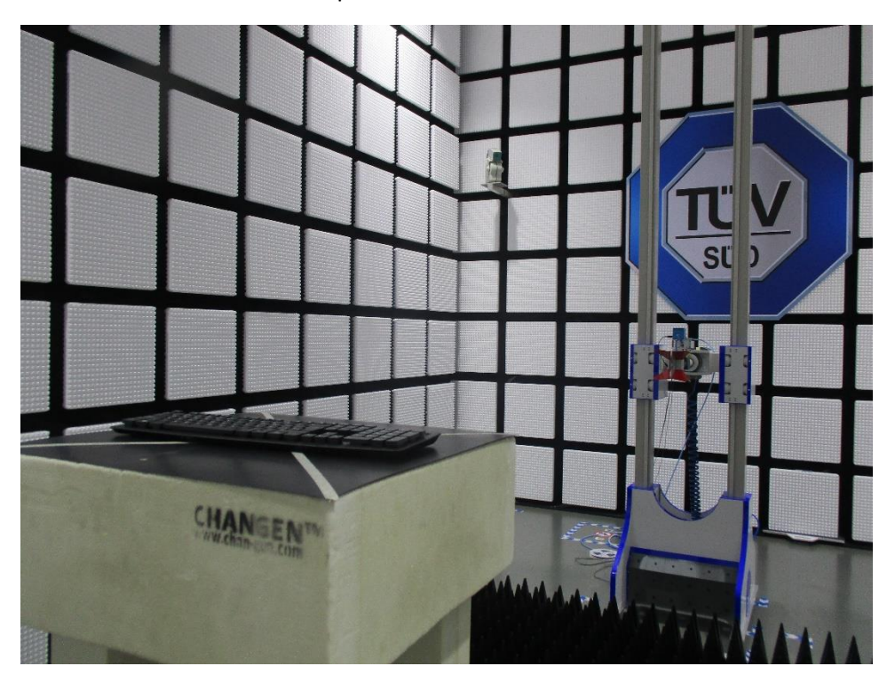
radiated spurious emission Above 1G