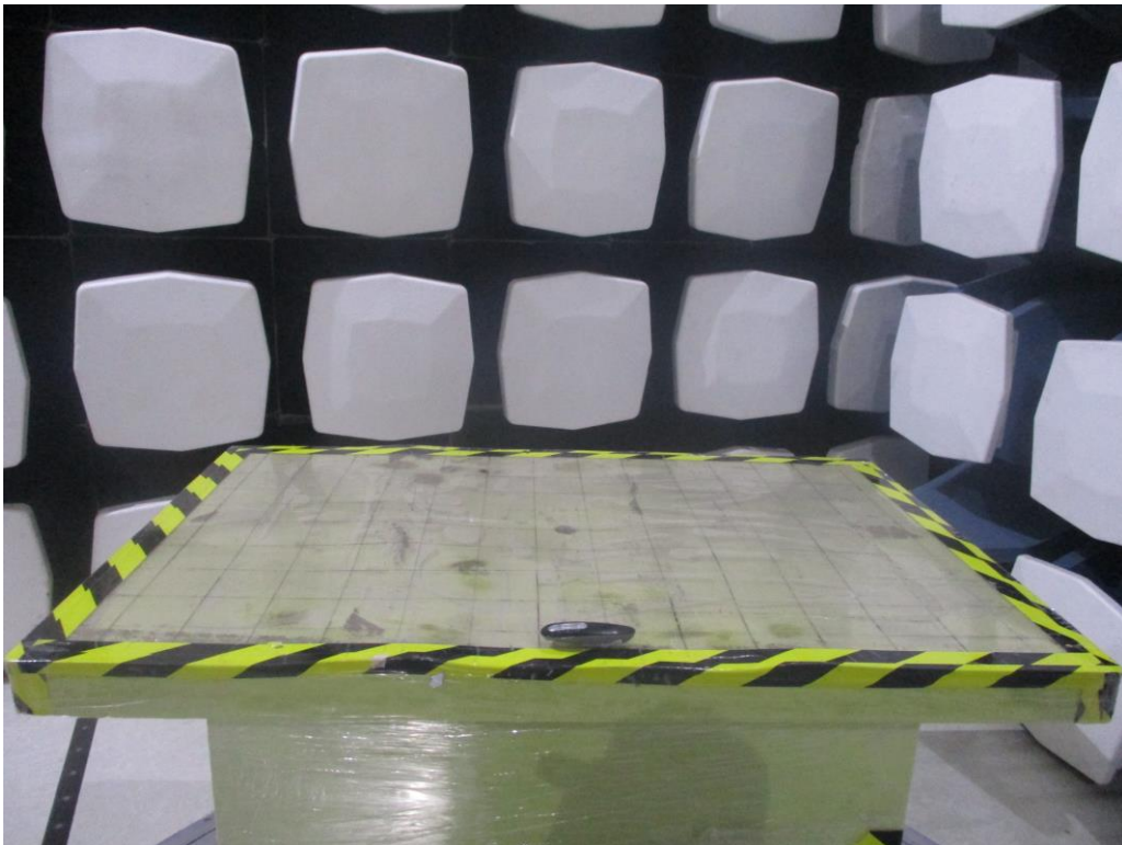
The EUT placed at the center of the turntable