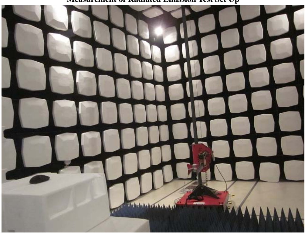
Measurement of Radiated Emission Test Set Up