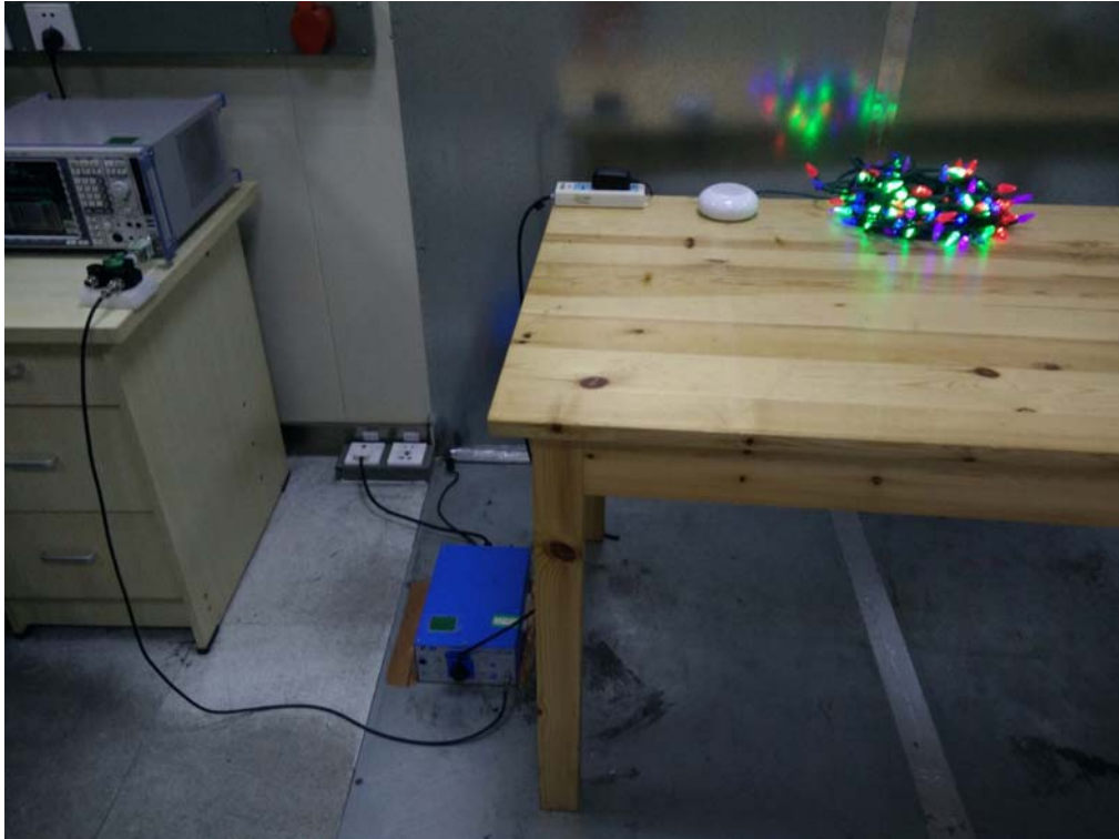
Radiated Spurious Emissions