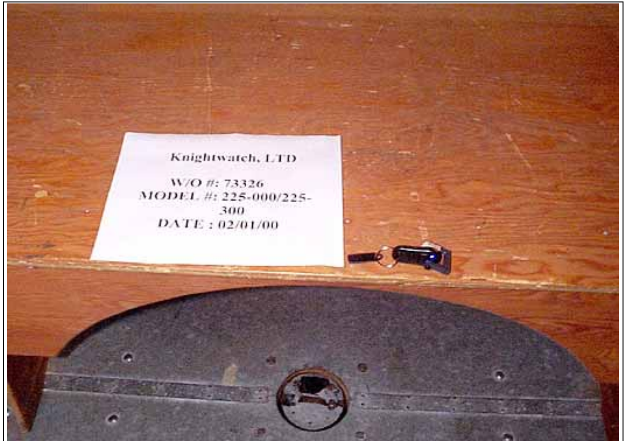
Radiated Emissions - Side View