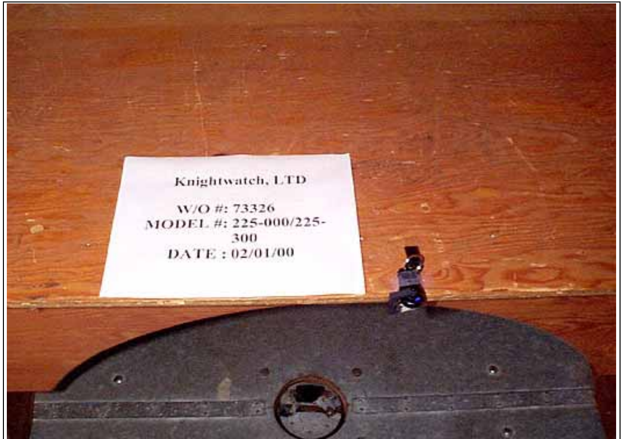
Radiated Emissions - Flat View