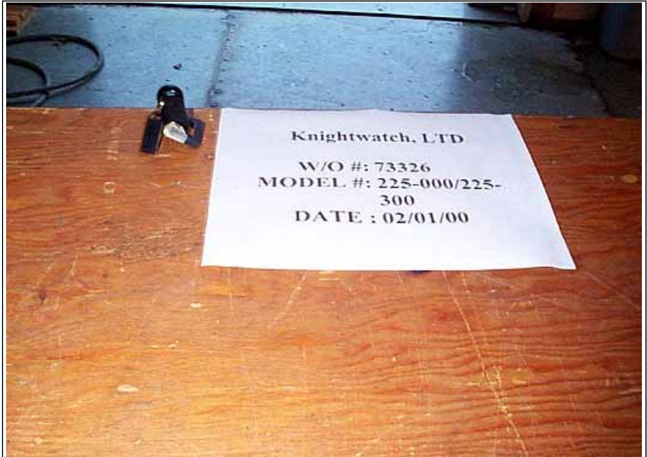
Radiated Emissions - Vertical Back View