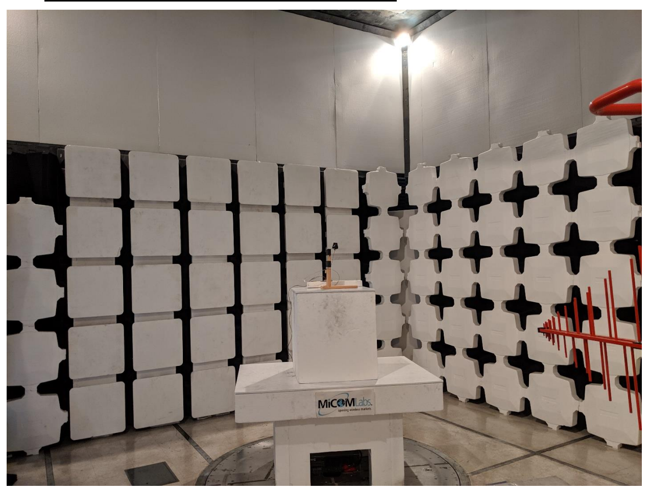
Radiated Spurious Emissions 30MHz-1GHz