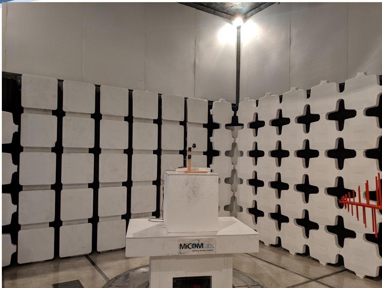
Radiated Spurious Emissions 30MHz-1GHz