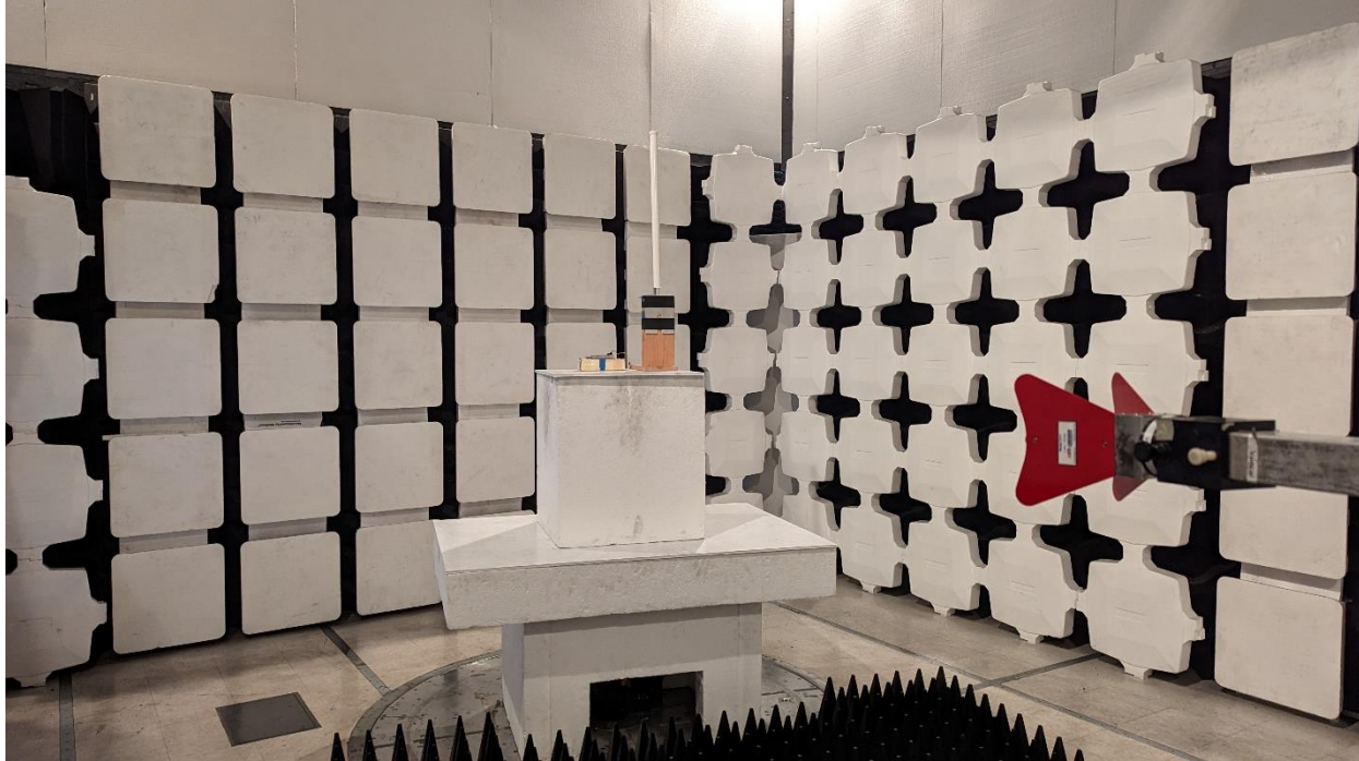
OWS-NIC541 Spurious Emissions 1-18GHz