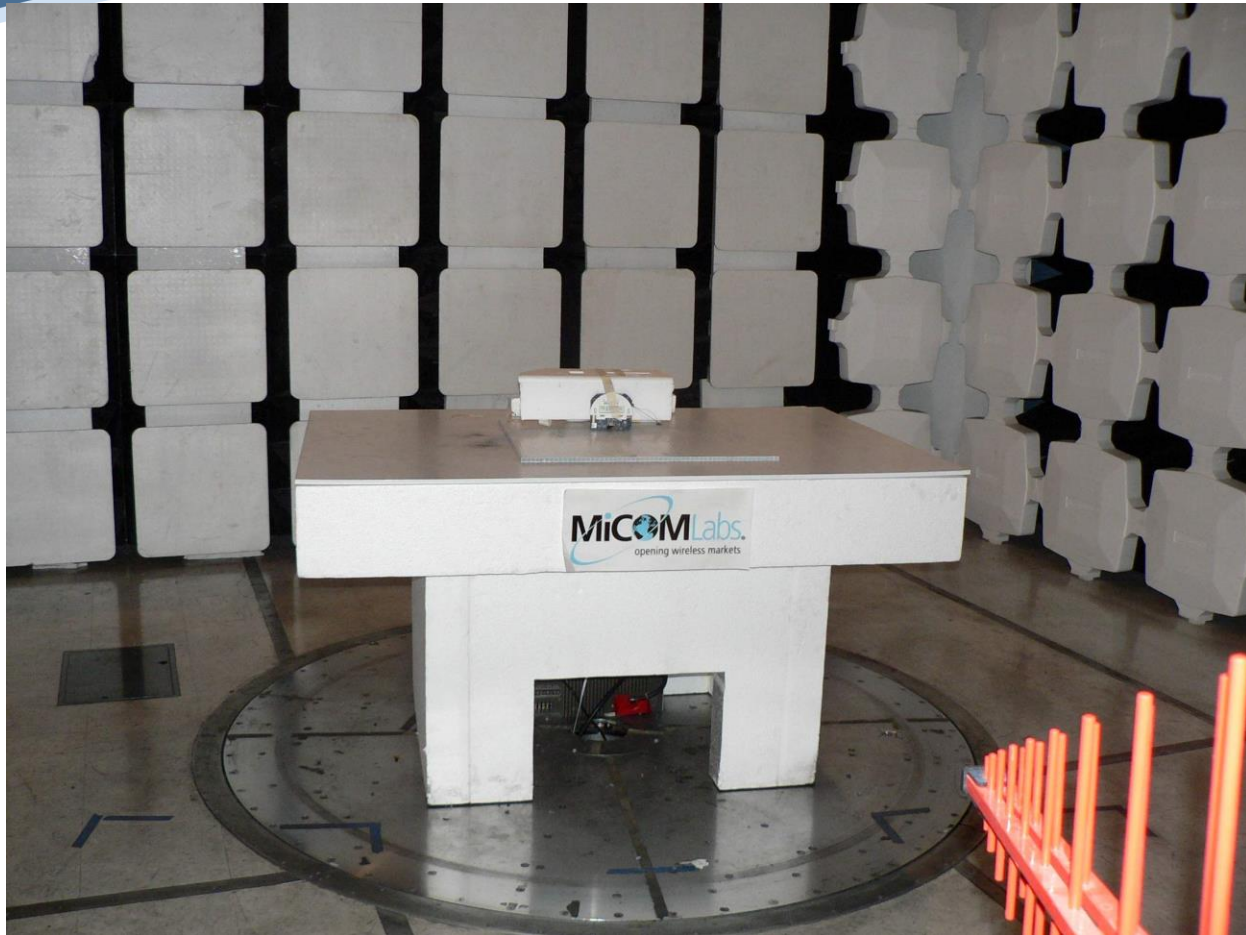
Digital Emissions 30-1000MHz