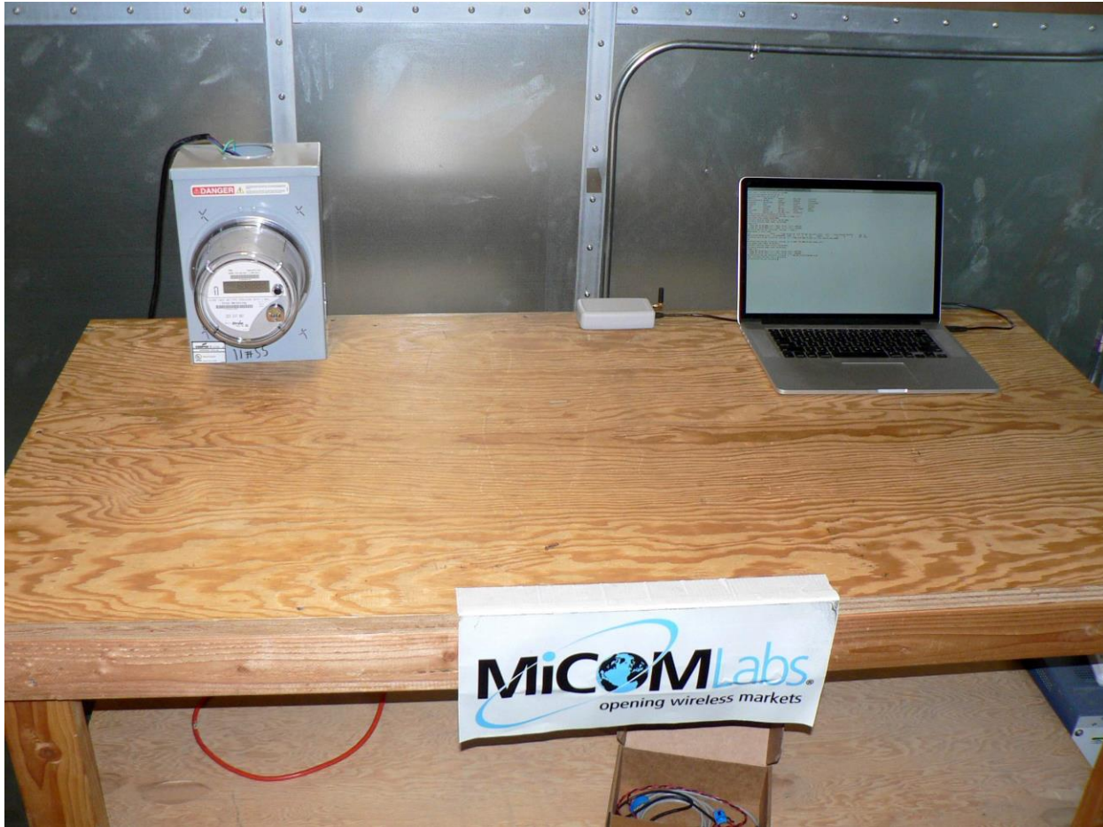
AC Mains Conducted