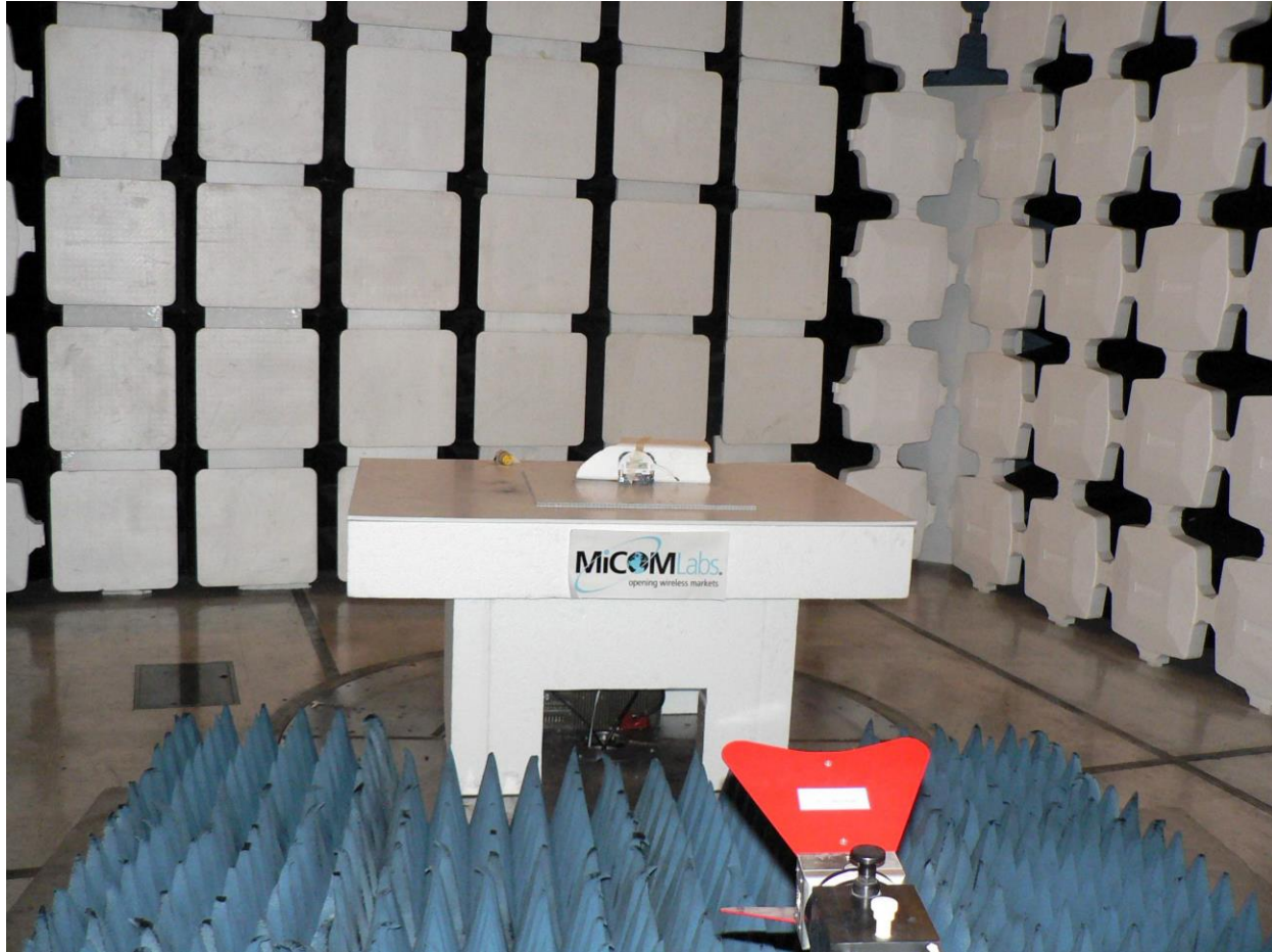
Digital Emissions 1-18GHz