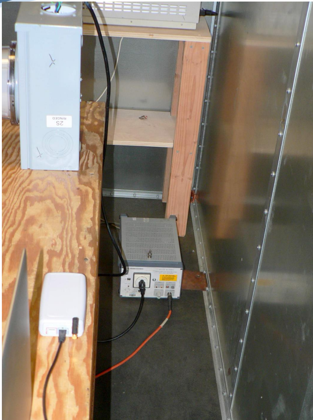
AC Mains Conducted Side