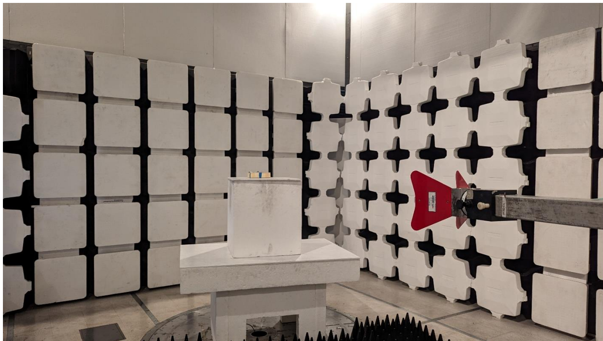
OWS-NIC511-06 Spurious Emissions 1-18GHz