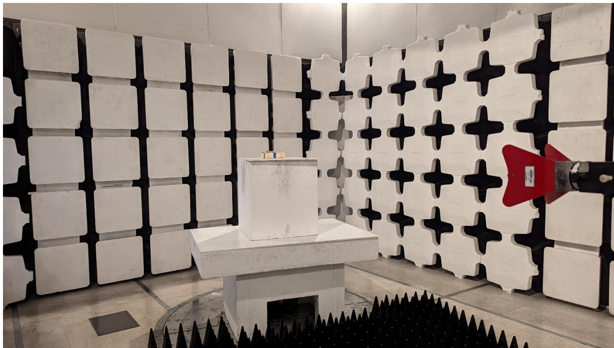
OWS-NIC511-03 Spurious Emissions 1-18GHz