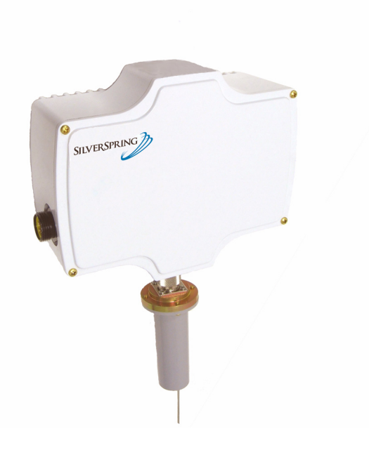
Figure 1. Relay SG

Figure 1 is a photograph of the Relay SG.