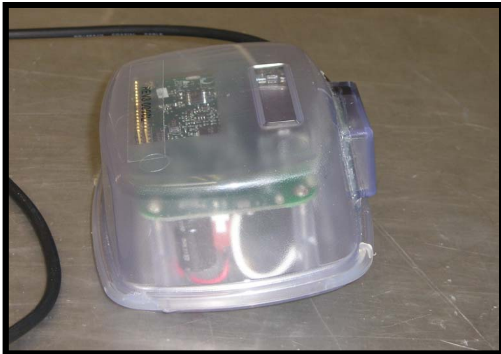
Figure 4: EUT Side View