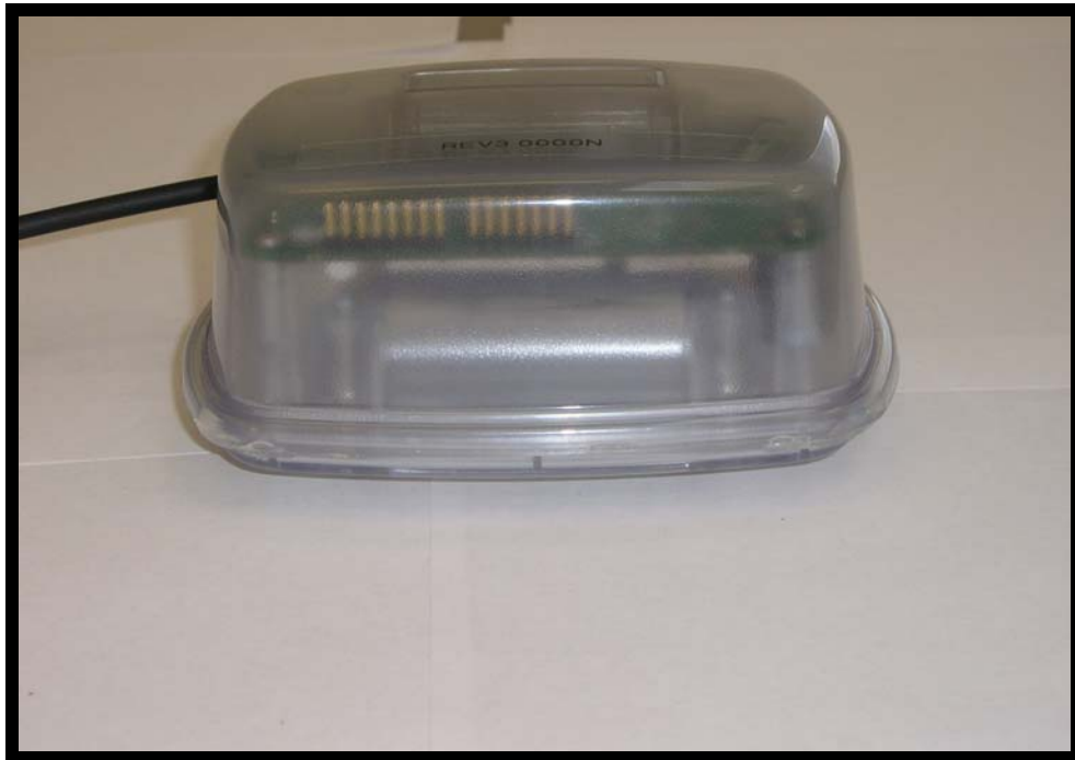
Figure 1: EUT Front View