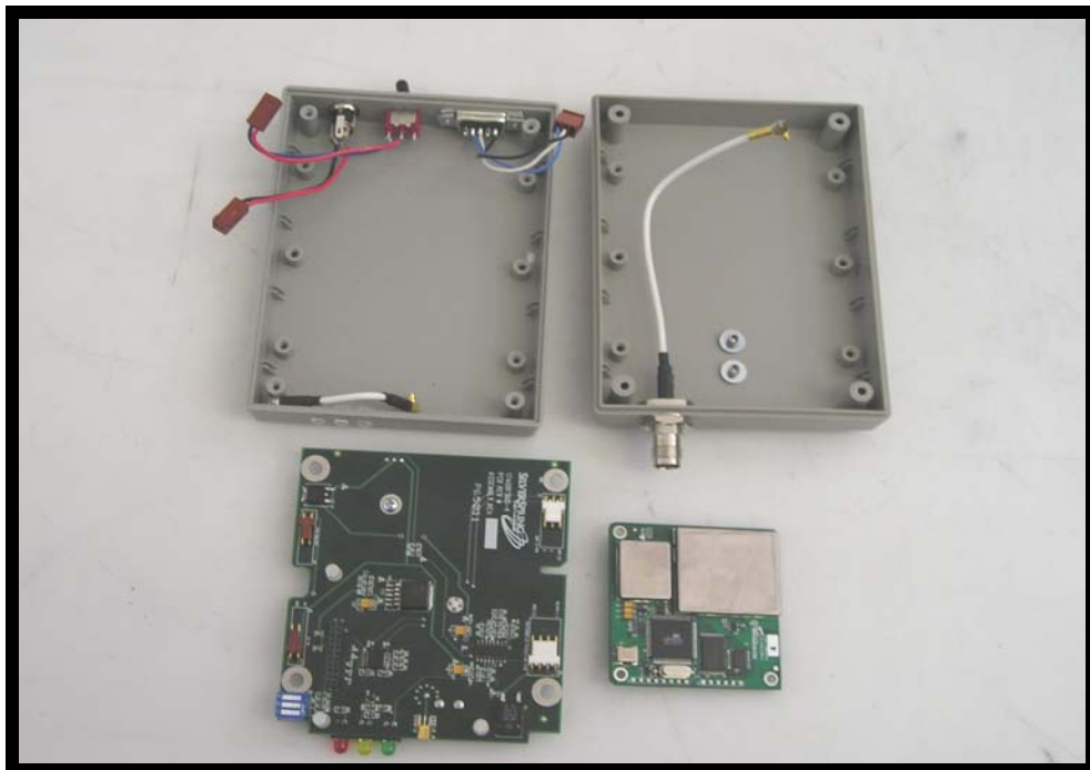
Figure 2: Component View

Prepared By: ITC Engineering Services, Inc. 9959 Calaveras Road, PO Box 543 Sunol, California 94586-0543 Tel: [925] 862-2944 Fax: [925] 862-9013 Email: docs@itcemc.com Web: www.itcemc.com