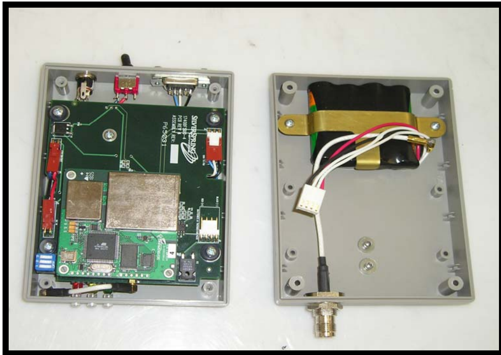
Figure 1: EUT Internal View