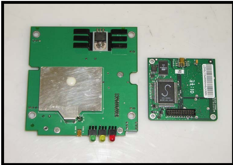
Figure 4: Solder View

Prepared By: ITC Engineering Services, Inc. 9959 Calaveras Road, PO Box 543 Sunol, California 94586-0543 Tel: [925] 862-2944 Fax: [925] 862-9013 Email: docs@itcemc.com Web: www.itcemc.com