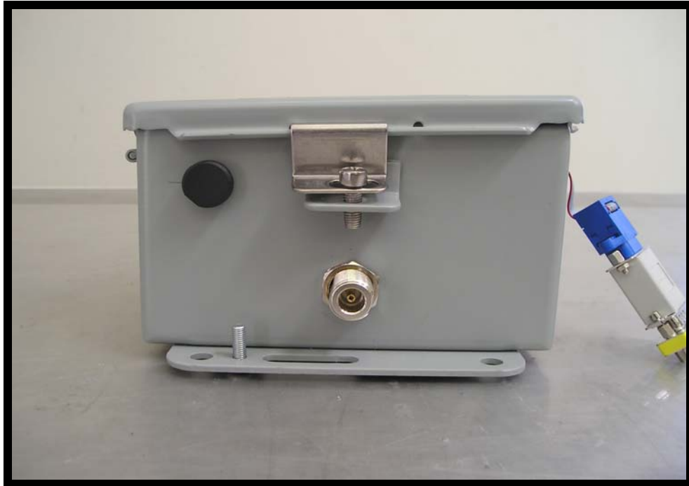
Figure 3: EUT Front View