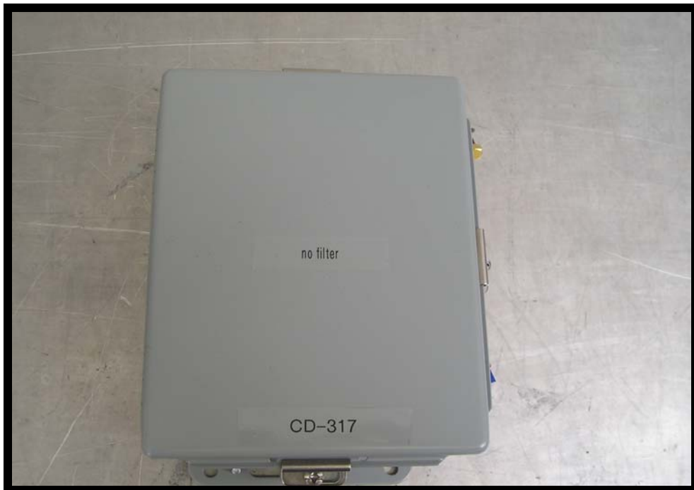
Figure 2: EUT Top View (without bandpass filter)