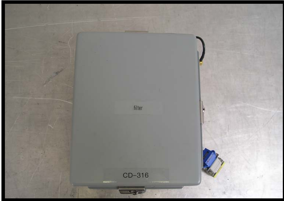
Figure 1: EUT Top View (with bandpass filter)