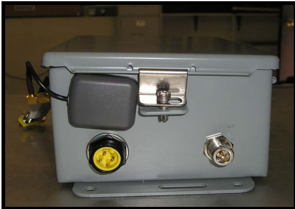
Figure 4: EUT Rear View