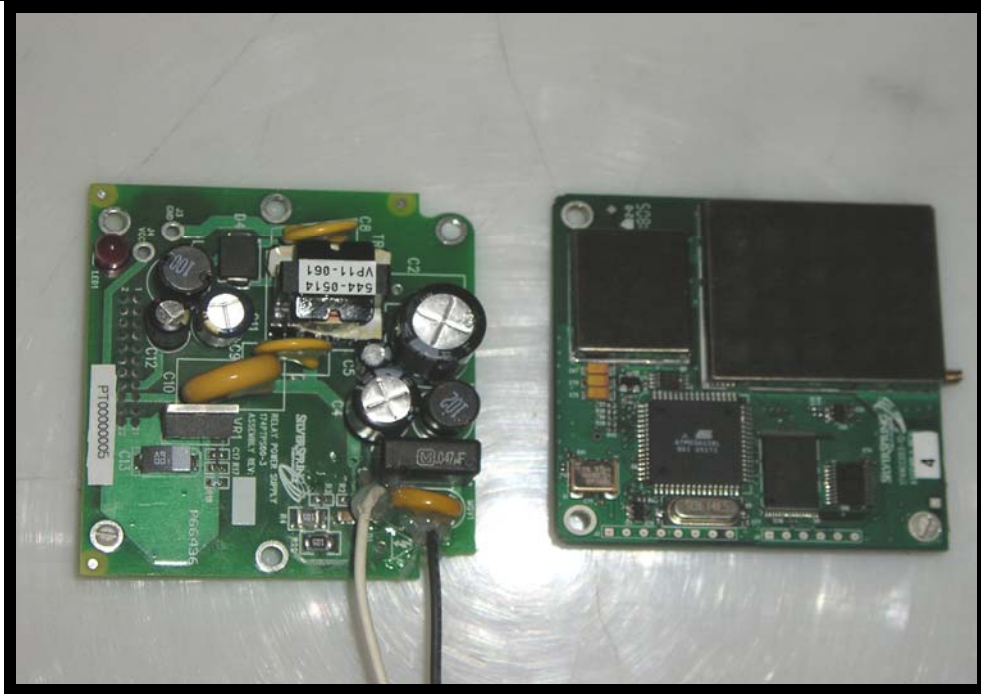
Figure 3: EUT Component View