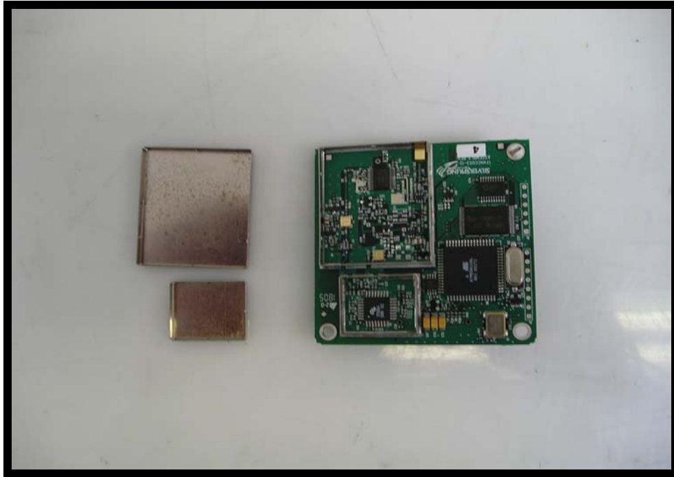
Figure 5: Component View with Shield off