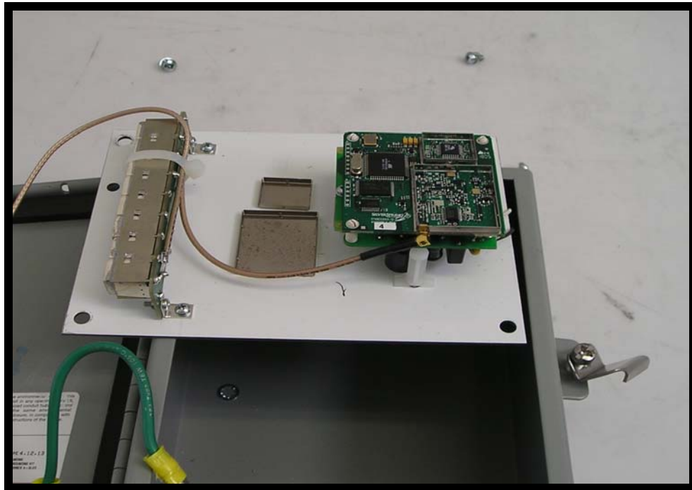
Figure 2: EUT Internal View2