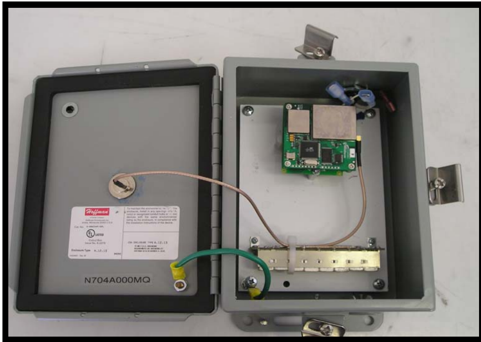
Figure 1: EUT Internal View1