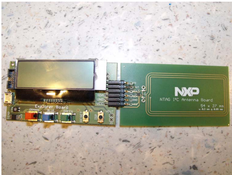
Picture of EUT

Tested sample number: S20155280 (Antenna Board 54 x 27 mm), S20155281 (Explorer board), S20155645 (Mobile phone) Final measurements done with Nexus S phone (sn:32338E3C360E00EC); Android version 4.1.2.