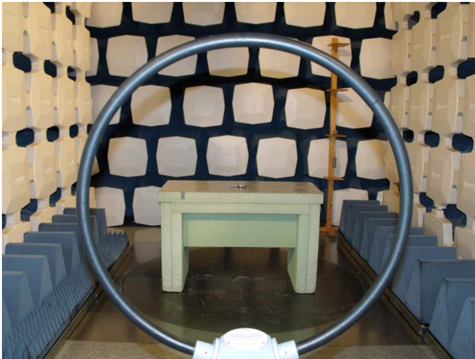
Figure 1: Radiated emission test – under 30 MHz