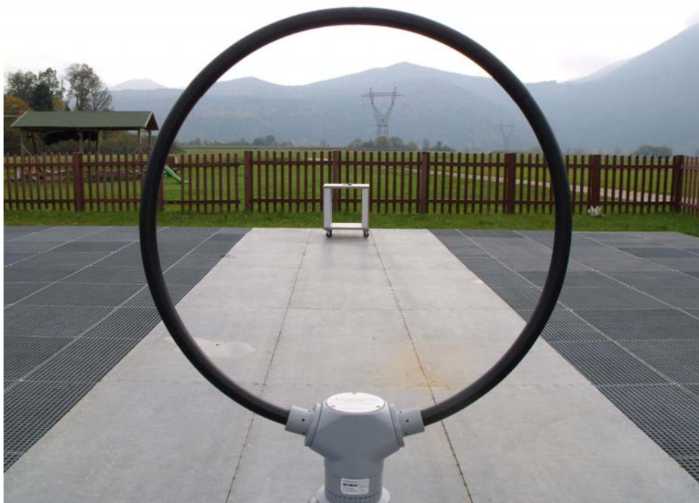
Figure 3: Radiated emission test – under 30 MHz on OATS