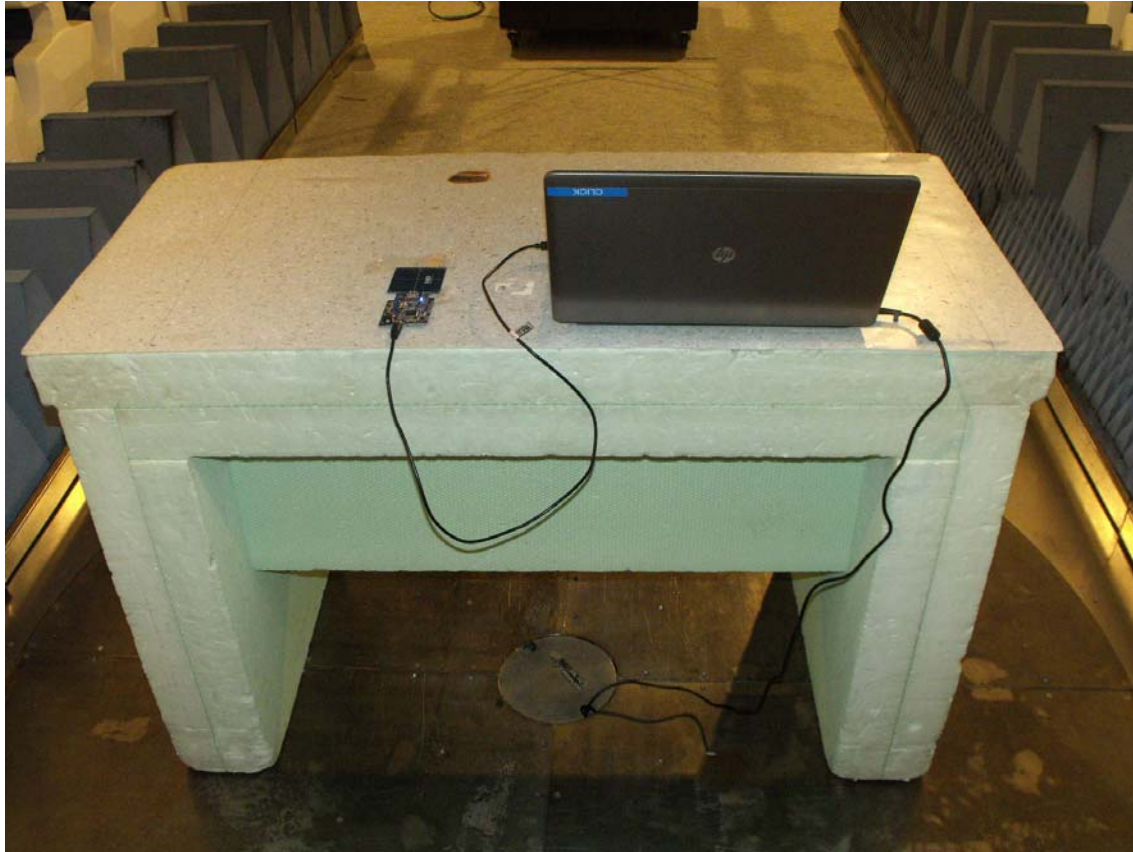
Figure 7: Radiated emission test, USB power supply