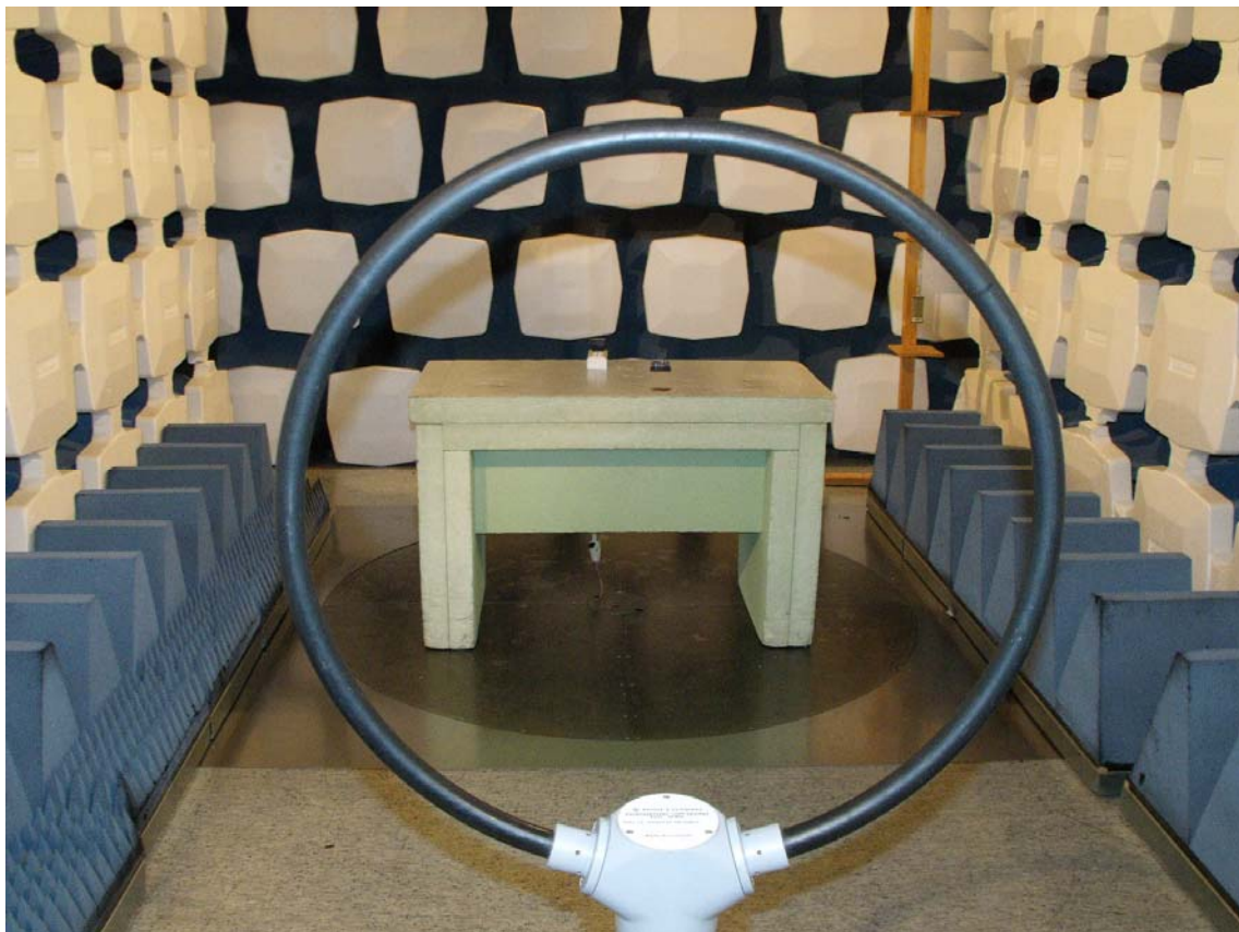
Figure 4: Radiated emission test, below 30 MHz, External power supply