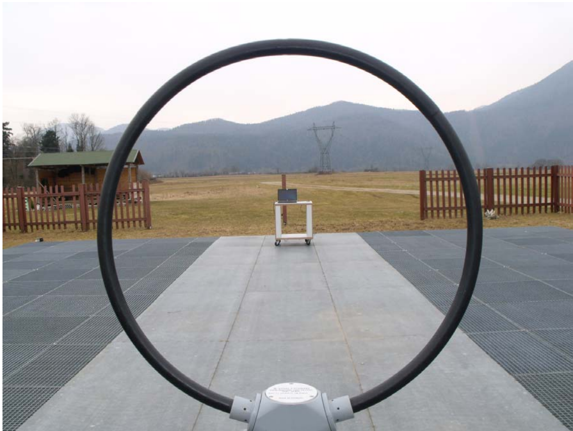
Figure 9: Radiated emission test - OATS