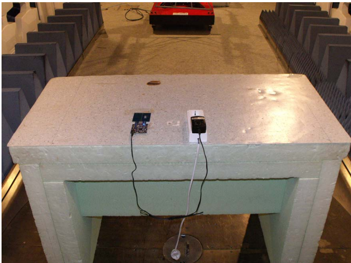
Figure 8: Radiated emission test, External power supply