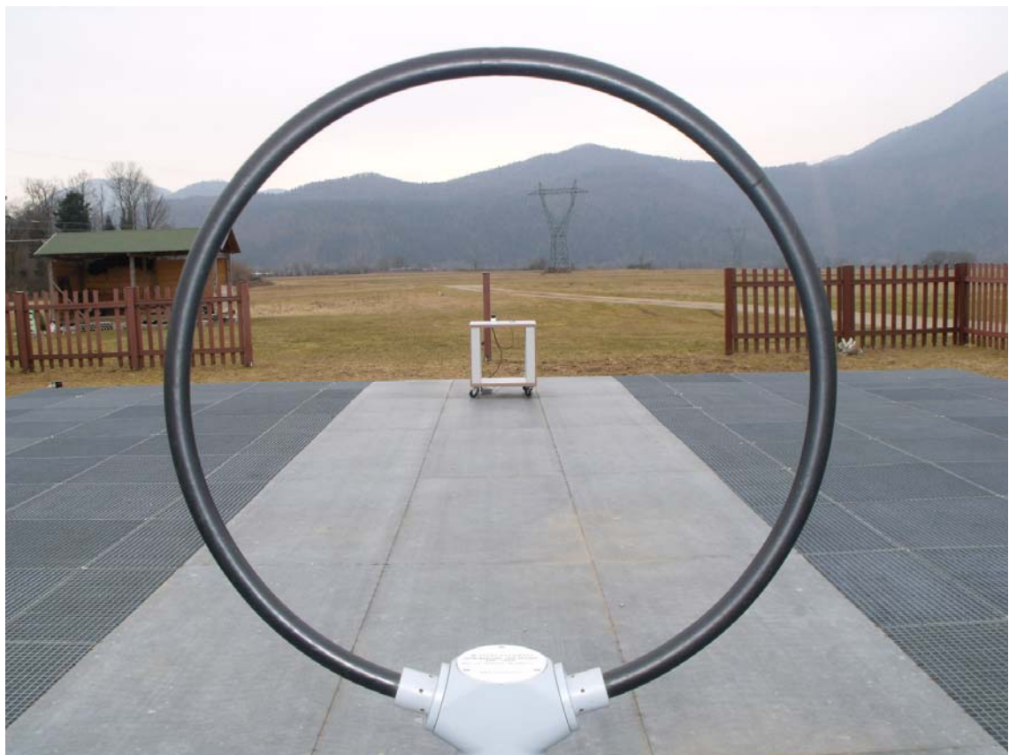
Figure 10: Radiated emission test - OATS