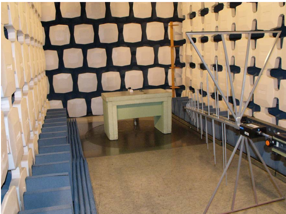
Figure 6: Radiated emission test, above 30 MHz, External power supply