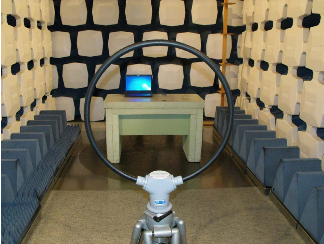
Figure 3: Radiated emission test, below 30 MHz, USB power supply