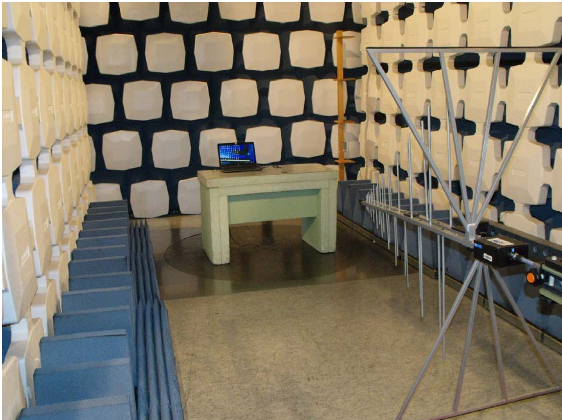
Figure 5: Radiated emission test, above 30 MHz, USB power supply