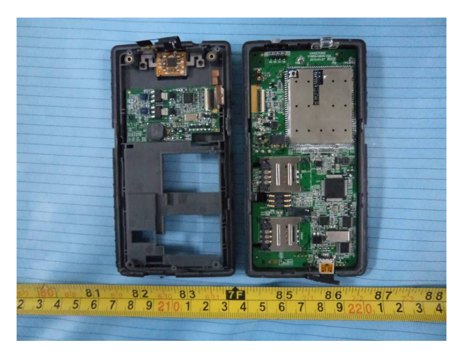
EUT – Cover off View

GPRS Ant NFC Ant VH808 VH808 O A CE X 157 158 159 16 7 8 9 330 1 2 3 4 5 6 7 8 9 400 1 2 3 4 5 6 7 8 9