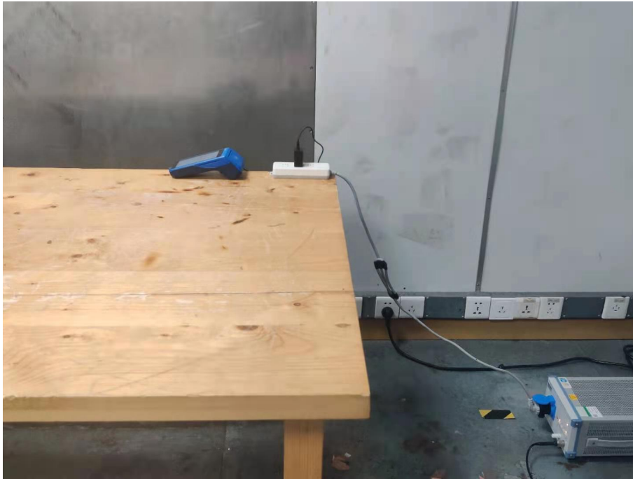
Photo of Conducted Emission Measurement