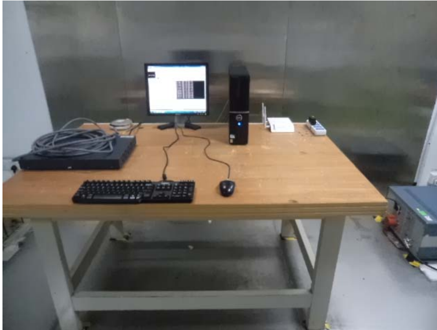
Conducted Emissions- Side View