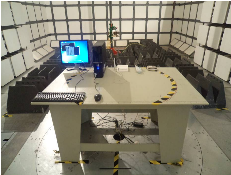
Spurious Radiated Emissions – Rear View (Above 1 GHz)