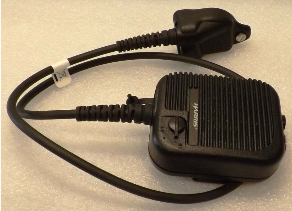
Figure D.19b– A51 – MC-011617-703 Speaker MIC w/ Antenna Port