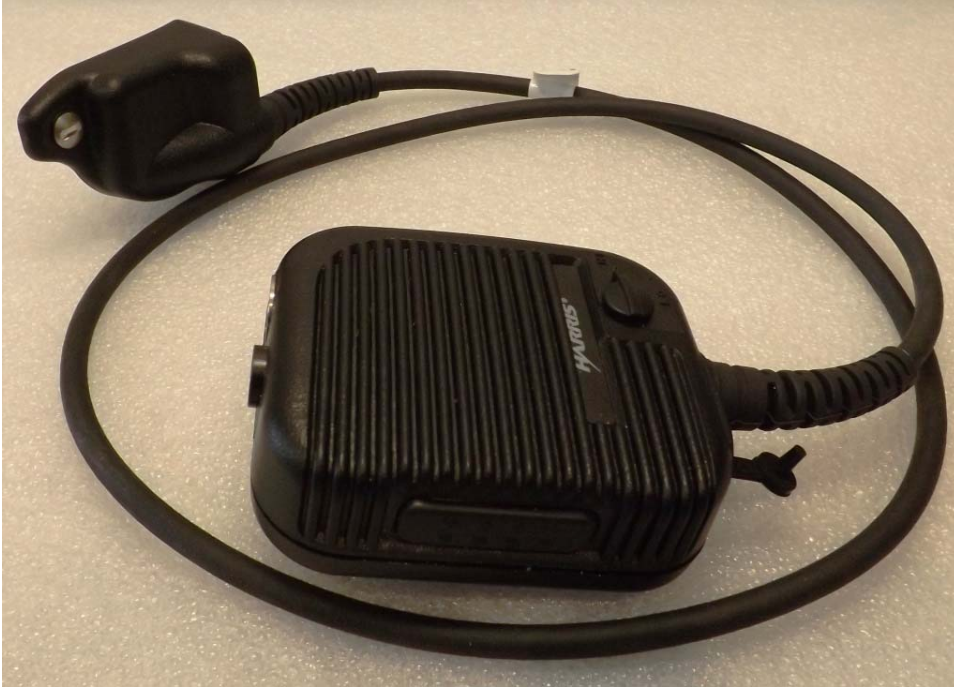
Figure D.18b– A50 – MC-011617-730 Speaker MIC w/ Antenna Port