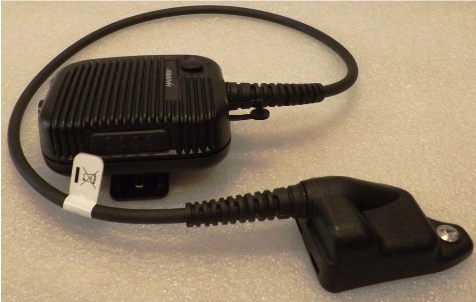
Figure D.20b– A52 – MC-011617-718 Speaker MIC w/ Antenna Port