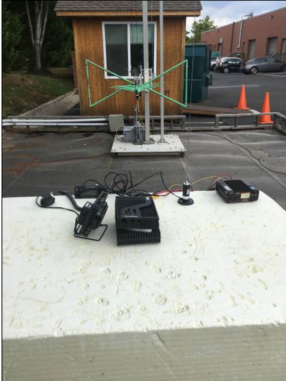
Photograph 1: Radiated Emissions (Spurious/Harmonics) – Front View (<1 GHz)