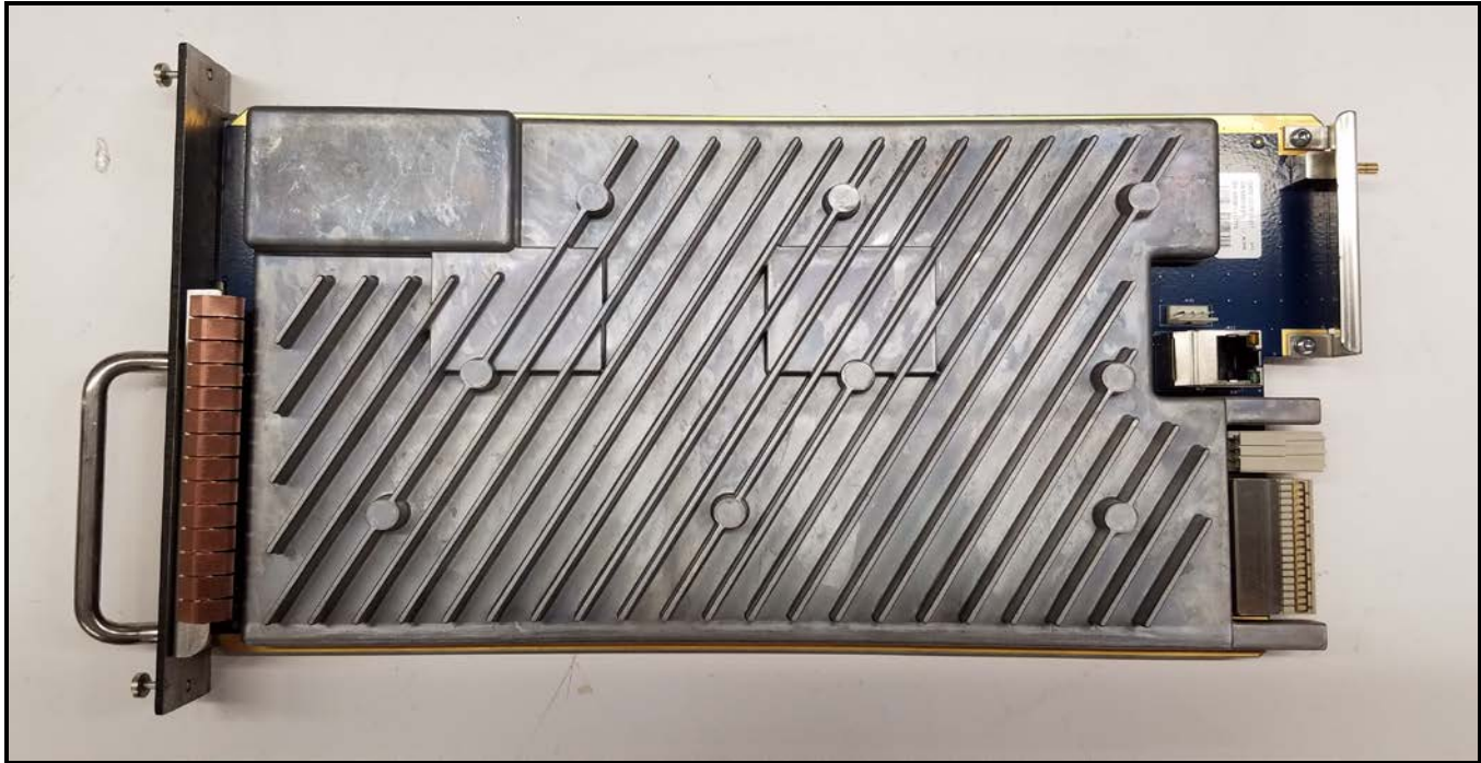
TX Module Right Side