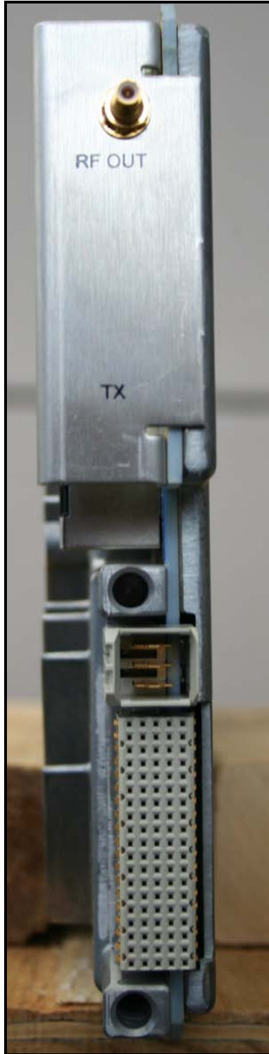
TX Module Back View