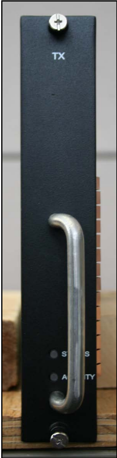
TX Module Front View