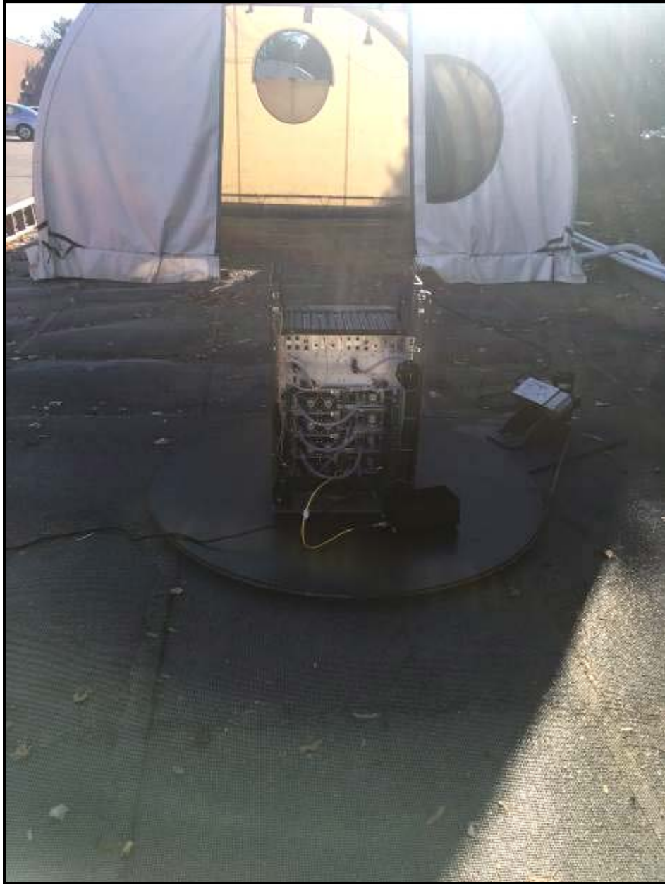
Photograph 4: Radiated Emissions (Spurious/Harmonics) – Back View (Below 1 GHz)