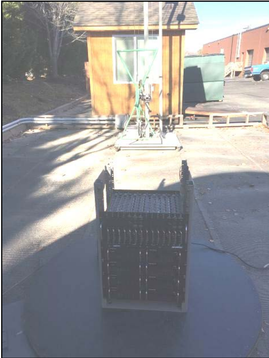
Photograph 3: Radiated Emissions (Spurious/Harmonics) – Front View (Below 1 GHz)