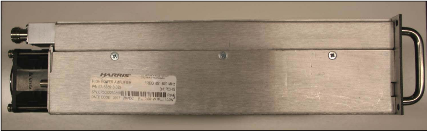
HPA Right Side