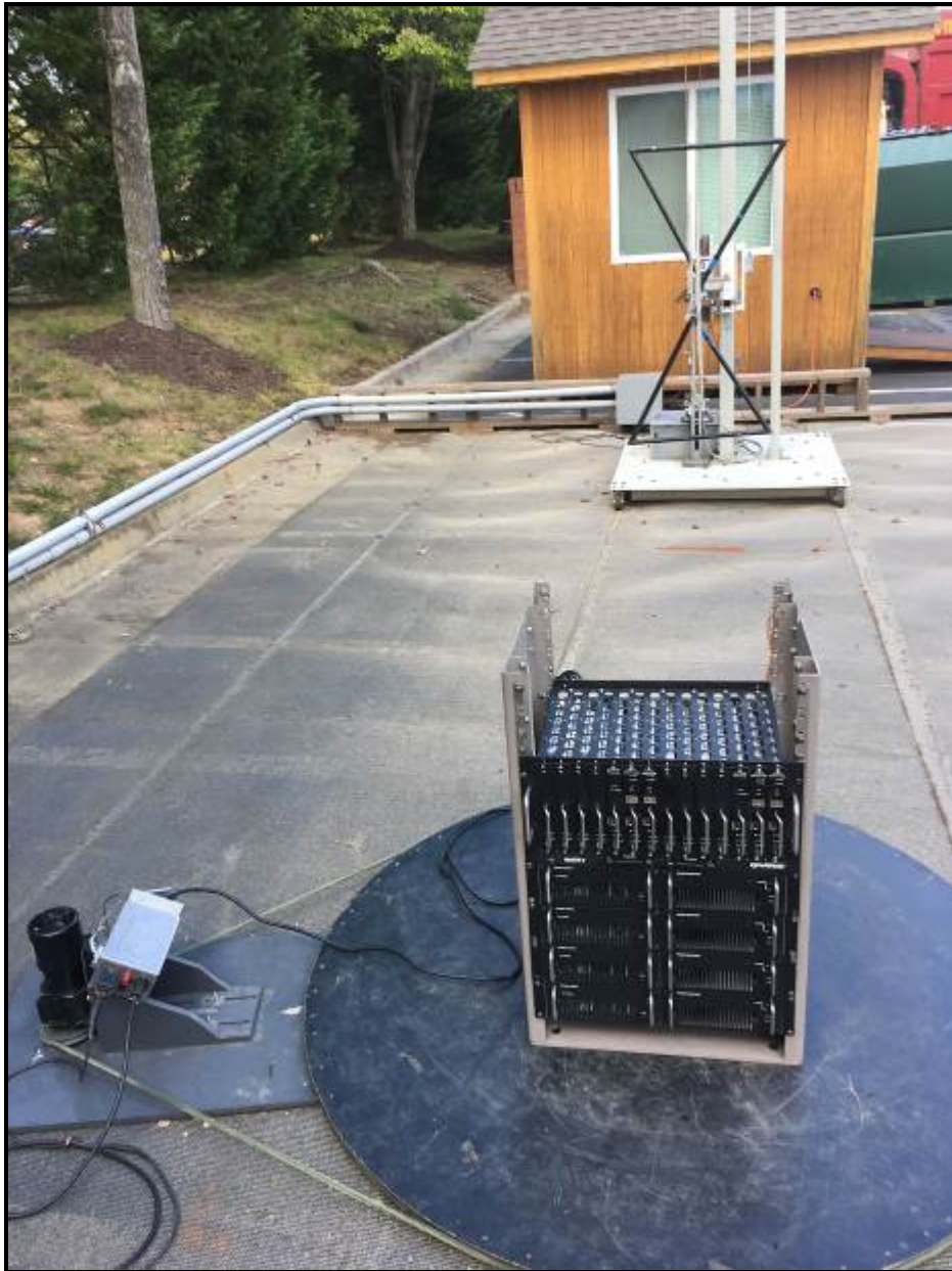
Photograph 3: Radiated Emissions (Spurious/Harmonics) – Front View (Below 1 GHz)