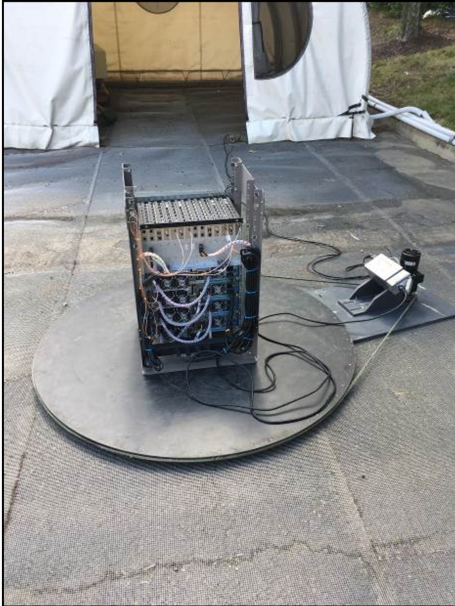
Photograph 4: Radiated Emissions (Spurious/Harmonics) – Back View (Below 1 GHz)