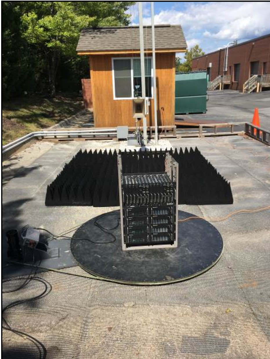
Photograph 1: Radiated Emissions (Spurious/Harmonics) – Front View (Above 1 GHz)