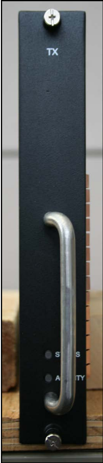
TX Module Front