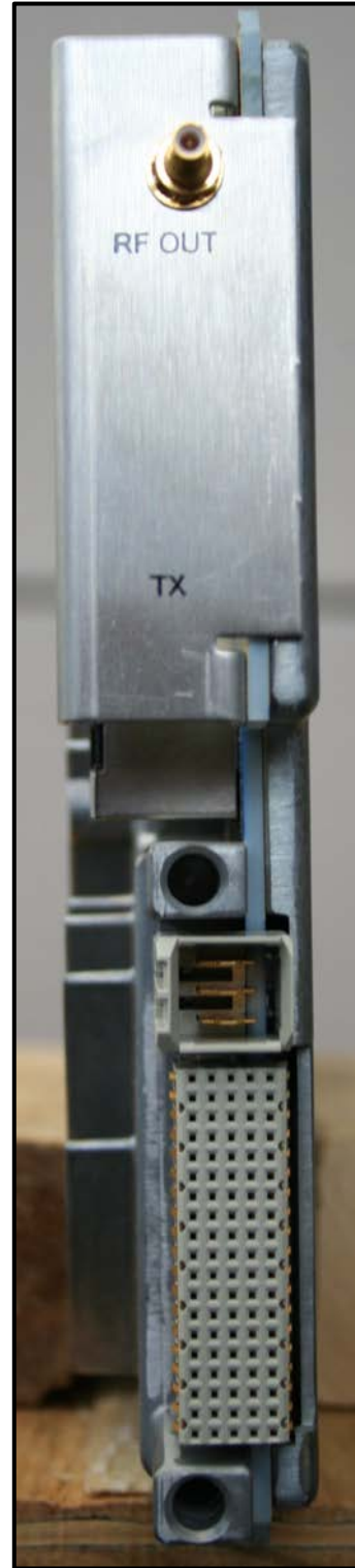
TX Module Back