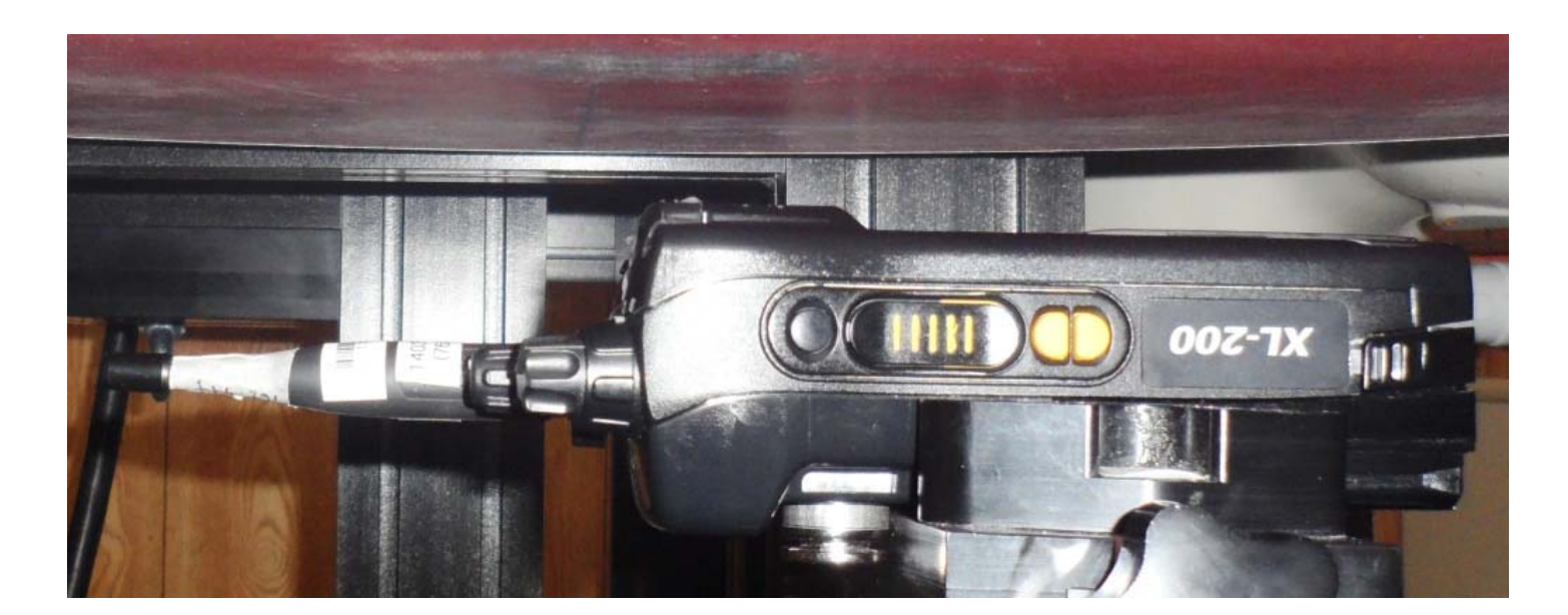
Figure C.7 - Body Configuration, D-Swivel