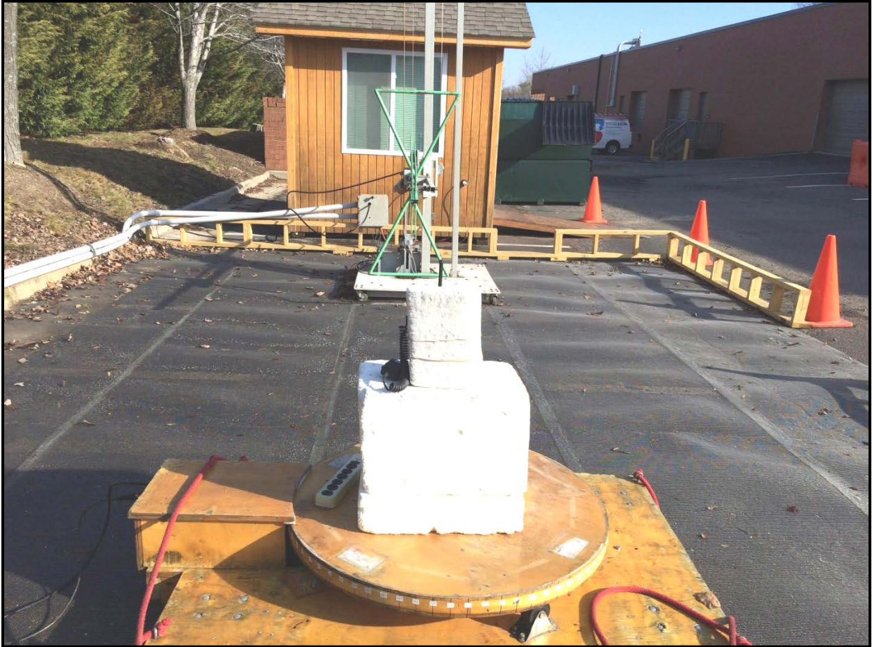
Photograph 2: Radiated Emissions – Back View