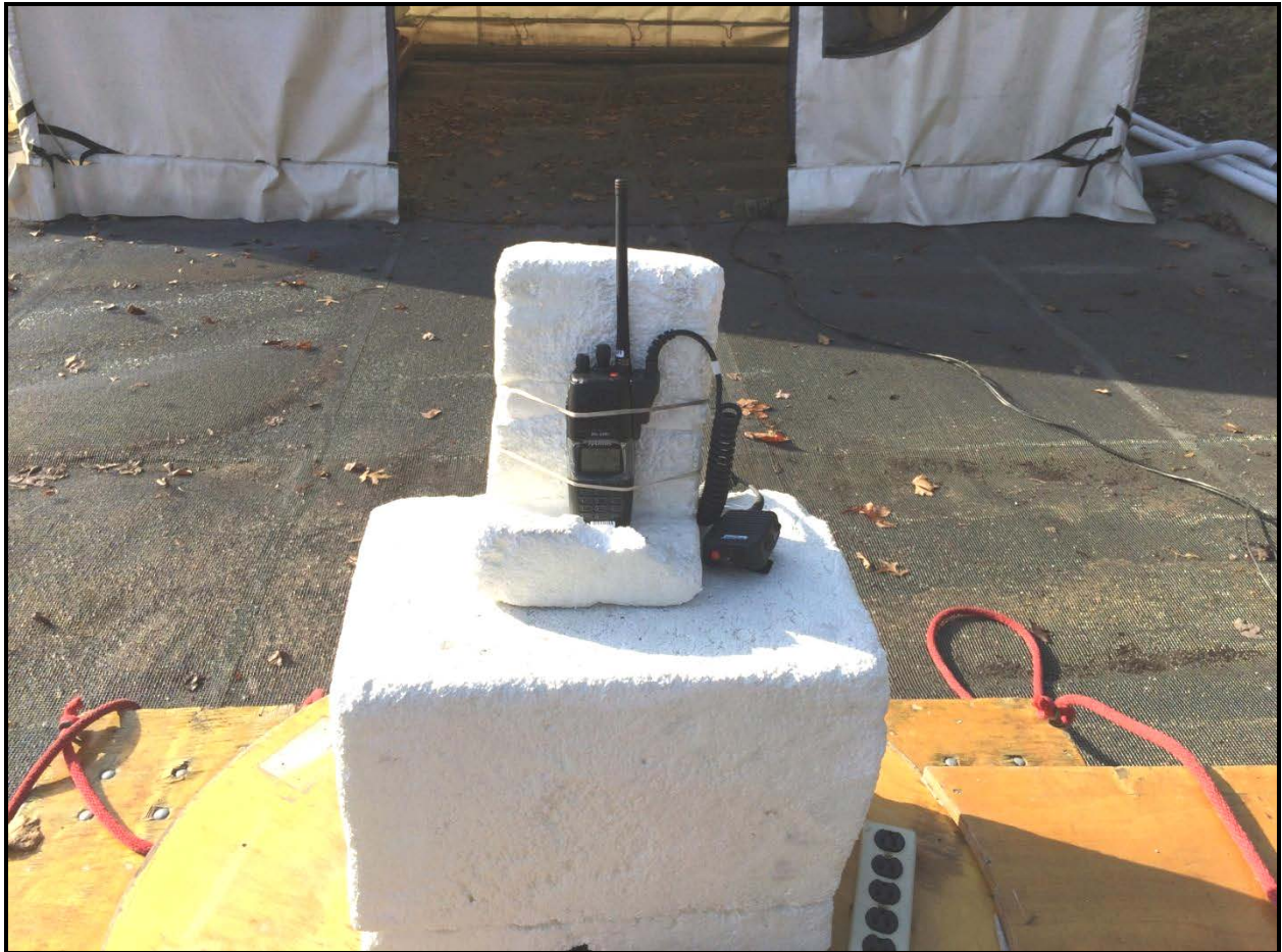
Photograph 1: Radiated Emissions – Front View