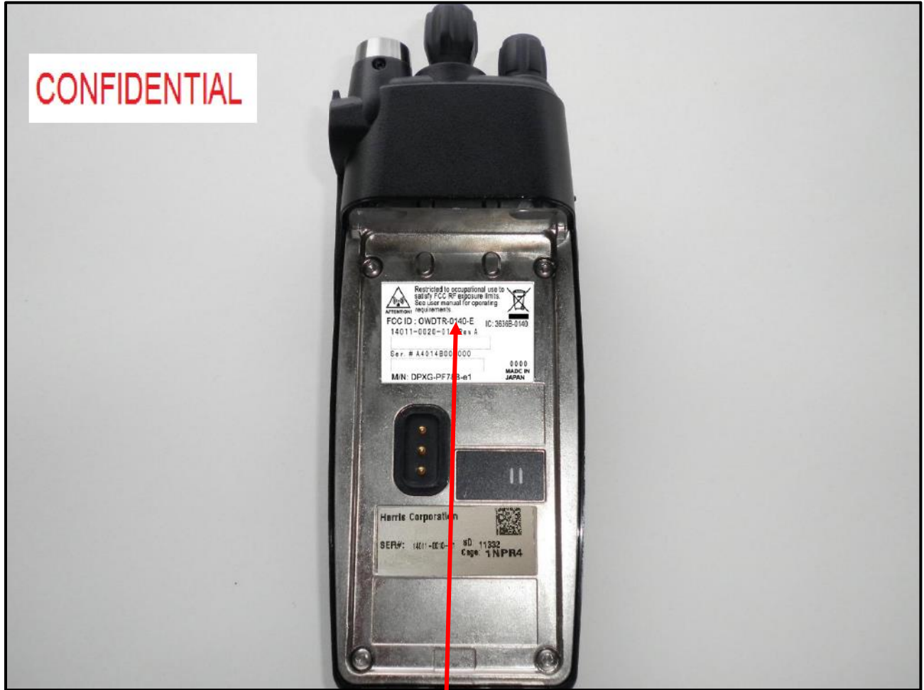
Photograph 3: ID and RF Safety Label Location