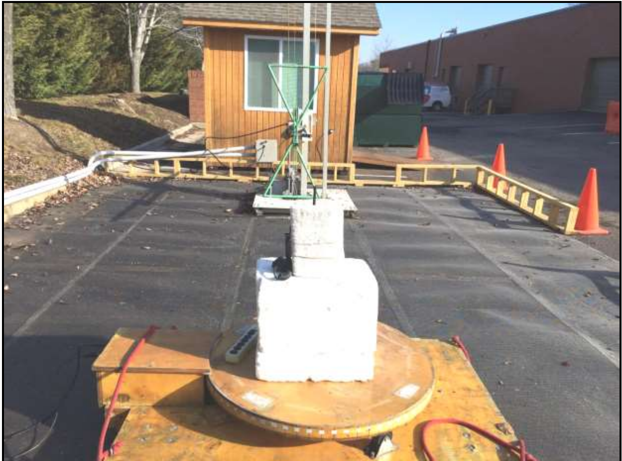
Photograph 2: Radiated Emissions – Back View