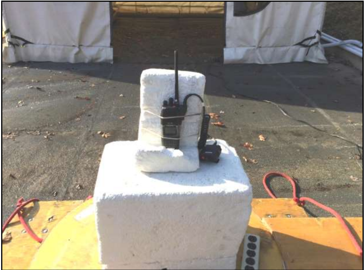
Photograph 1: Radiated Emissions – Front View