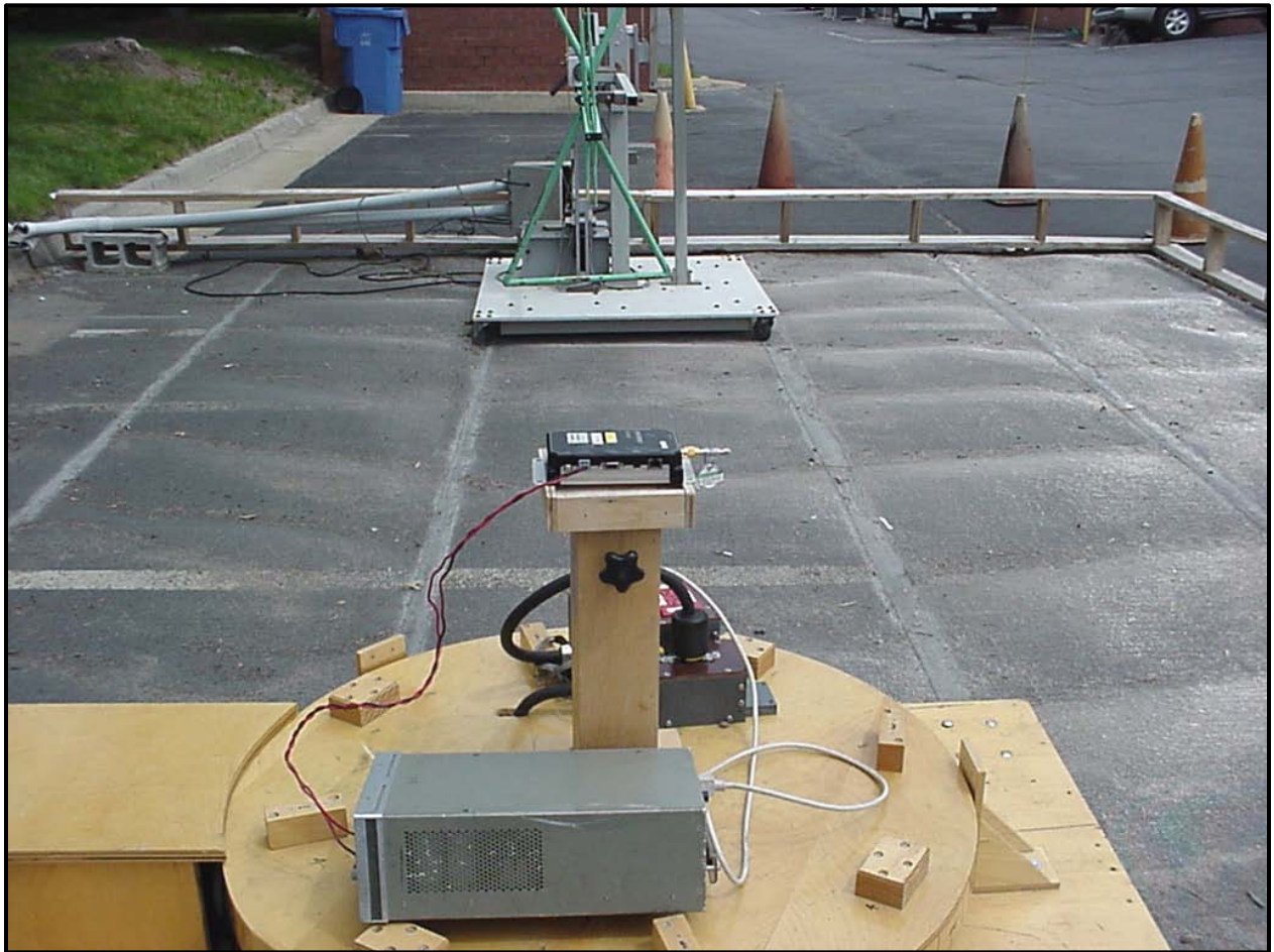
Photograph 4: Radiated Emissions – Back View