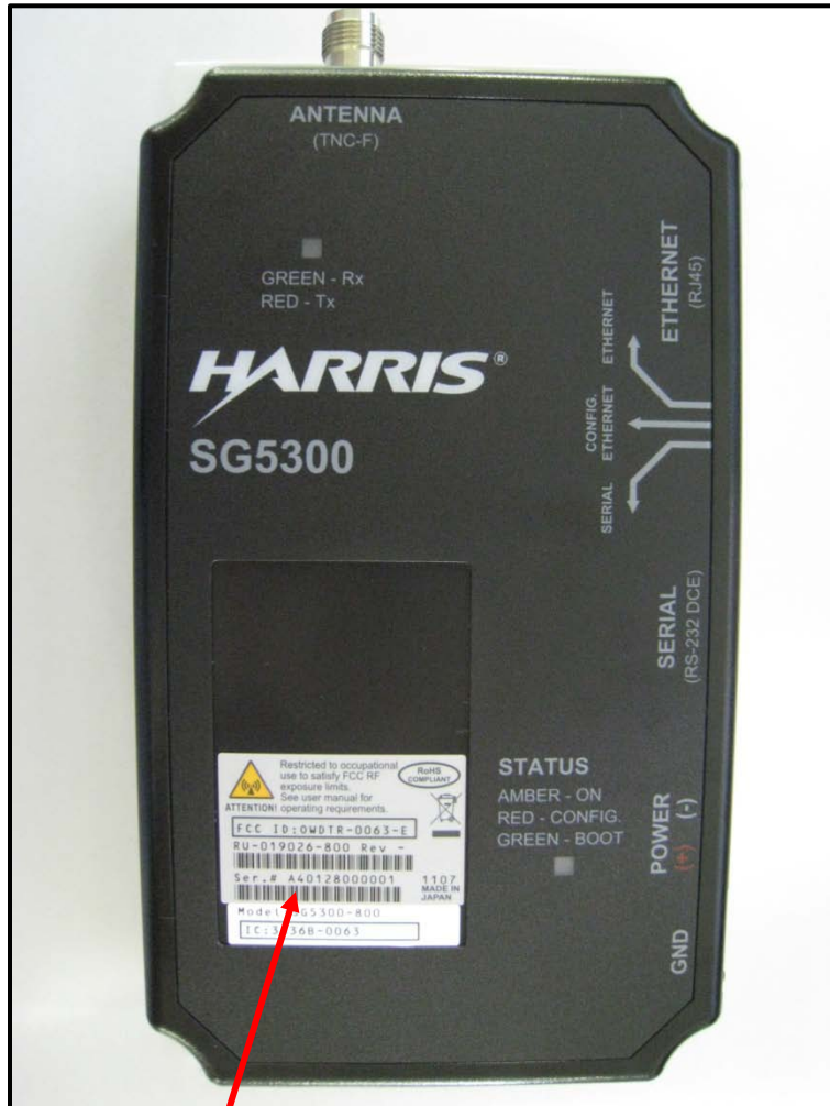
Photograph 2: ID Label Location