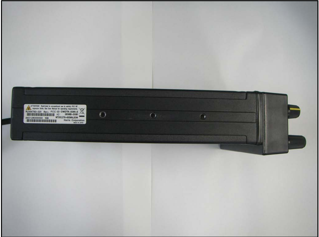
Photograph 3: ID Label Location