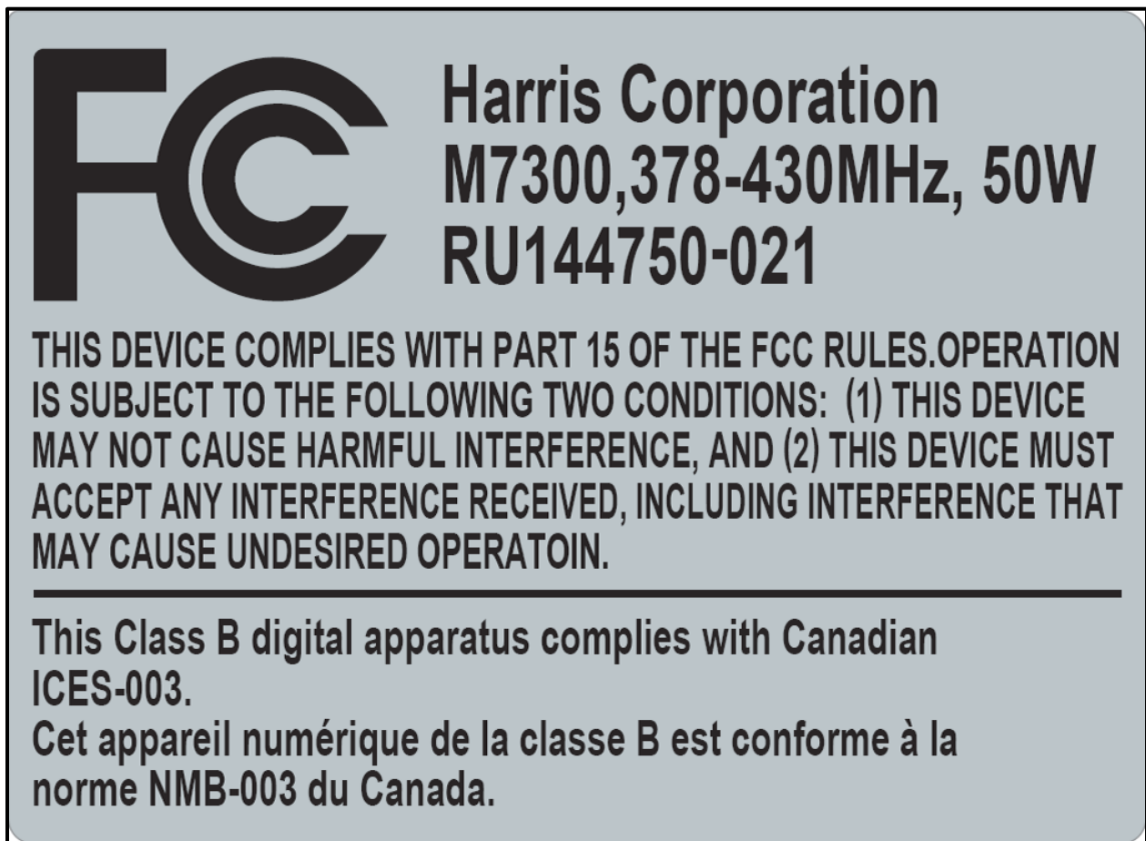
Photograph 2: Part 15 Label