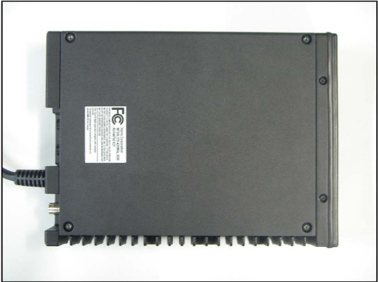
Photograph 4: Part 15 Label Location