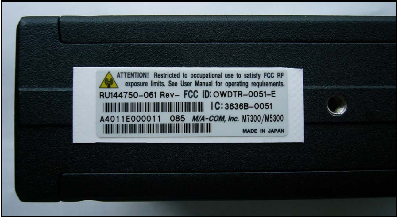
Photograph 1: FCC & IC ID Label Sample, with RF Statement & Location