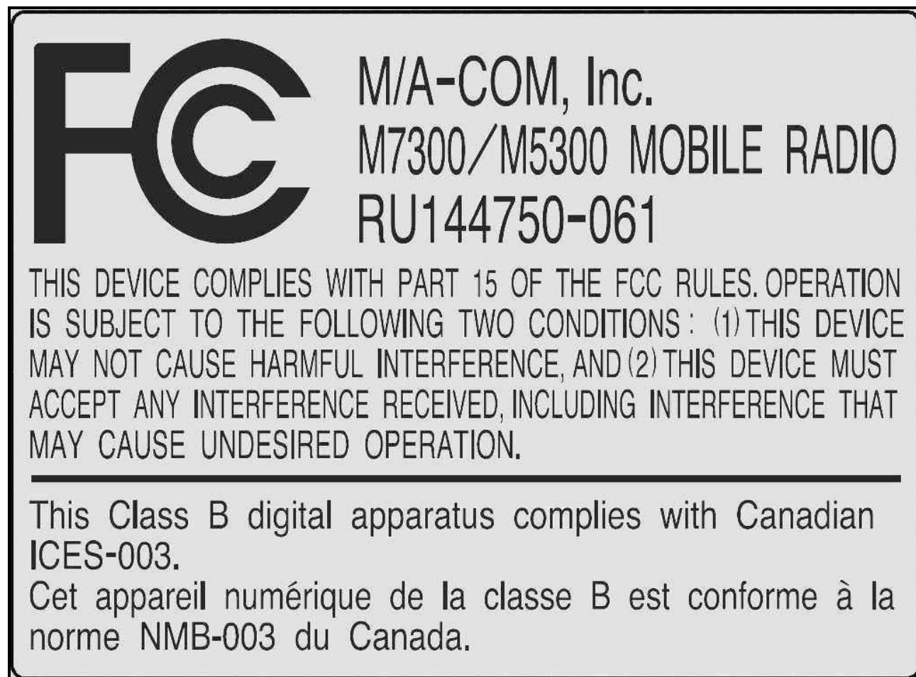
Photograph 2: Part 15.19 Label Sample