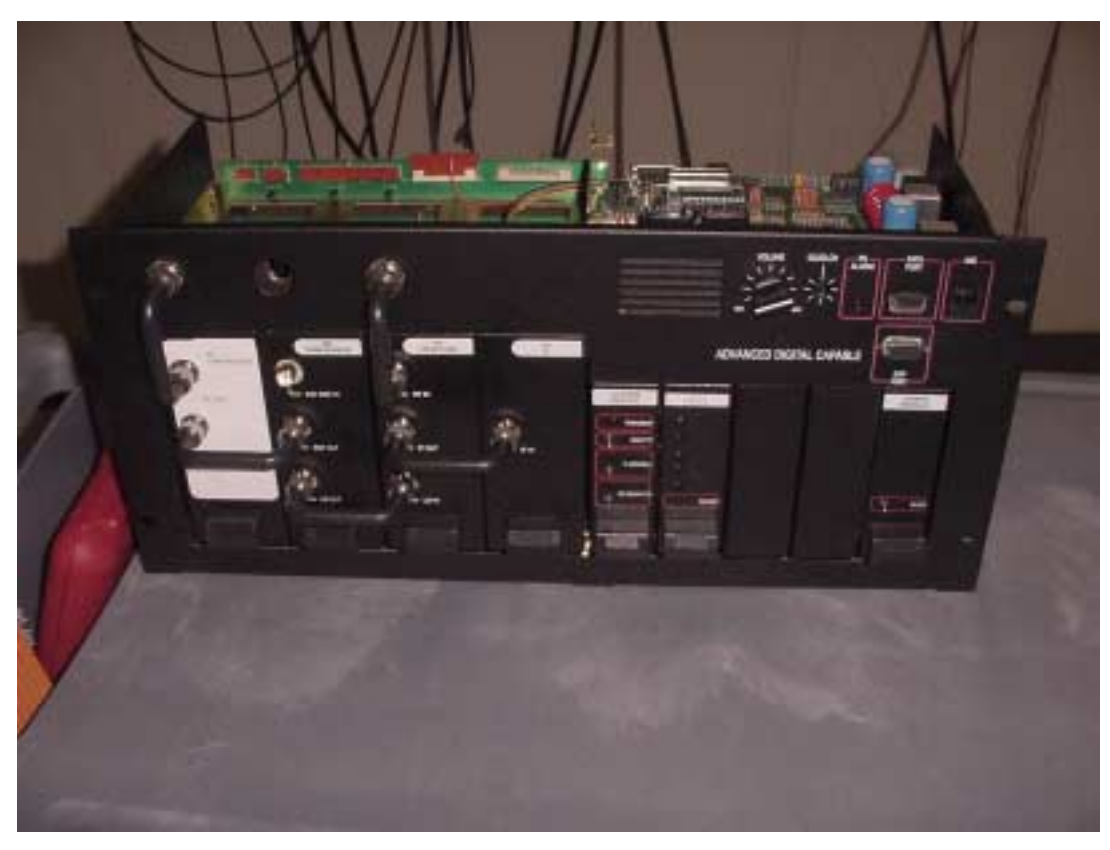
Figure 1 - Mastr III - Front View