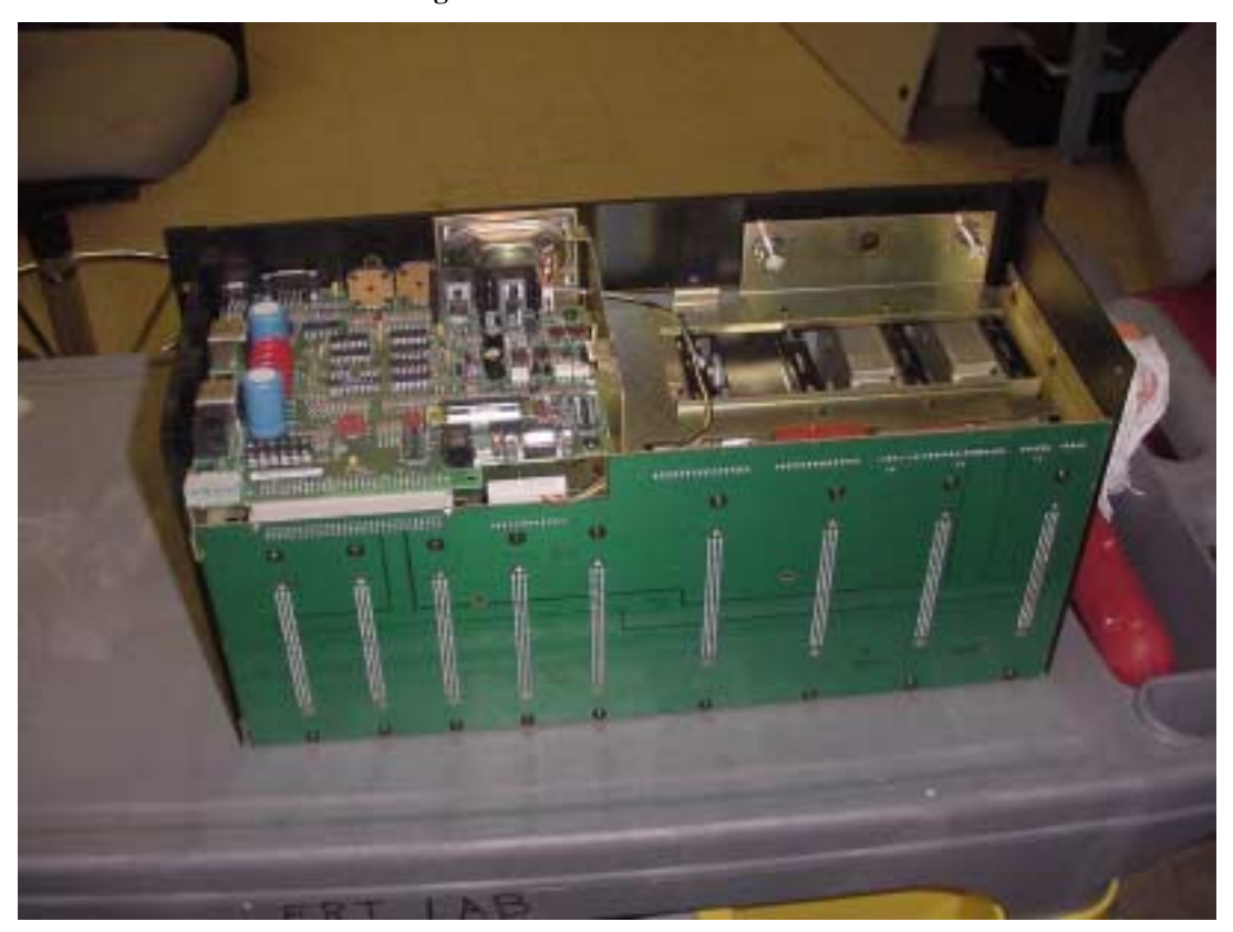
Figure 2 - Mastr III - Rear View