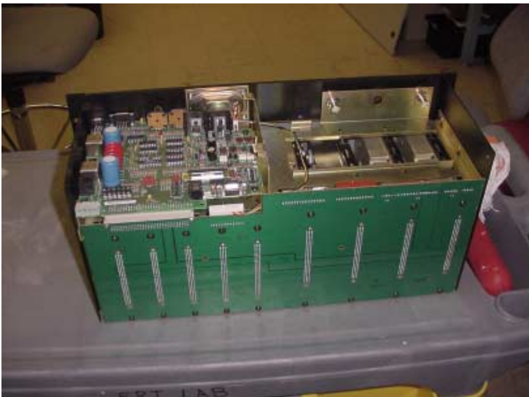
Figure 2 - Mastr III - Rear View