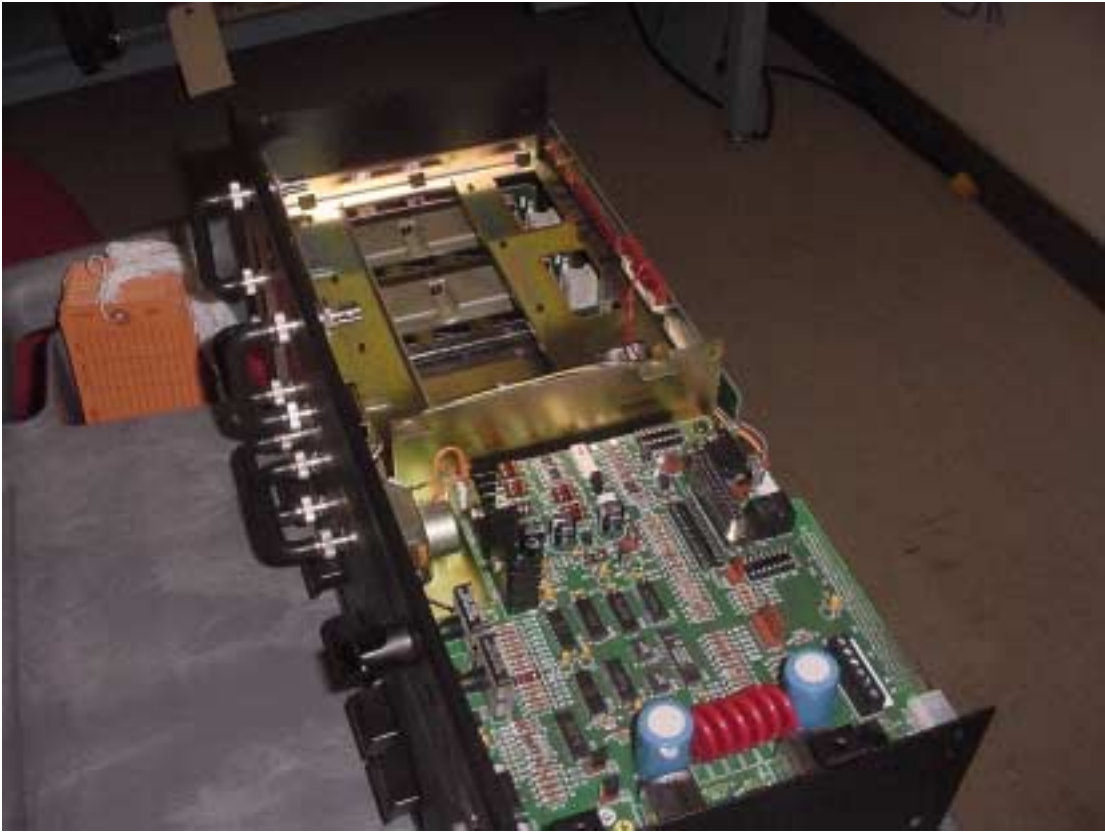
Figure 3 - Mastr III - Top Side View