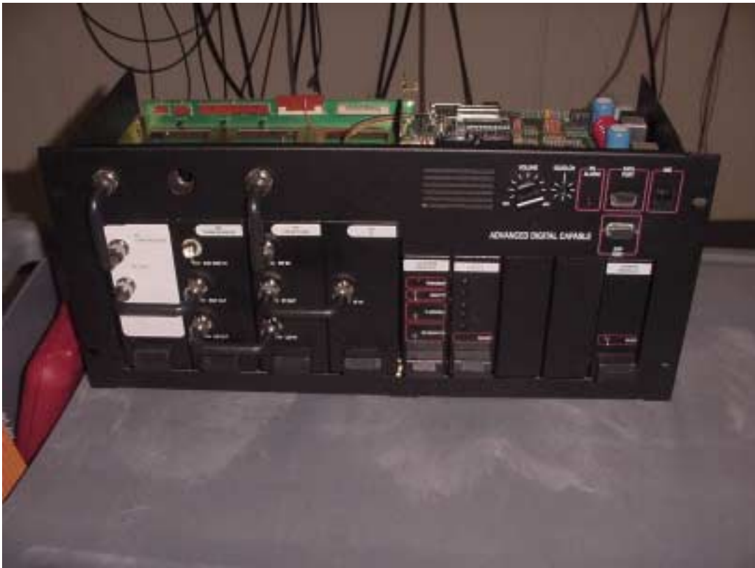
Figure 1 - Mastr III - Front View