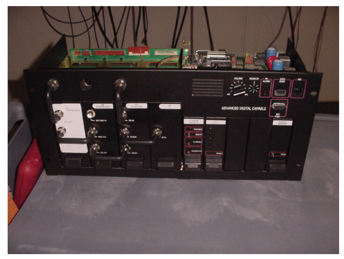
Figure 1 - Mastr III - Front View