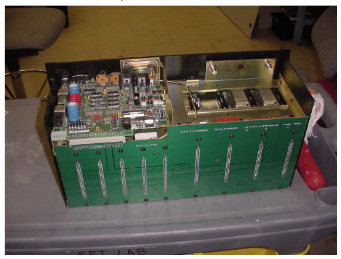
Figure 2 - Mastr III - Rear View